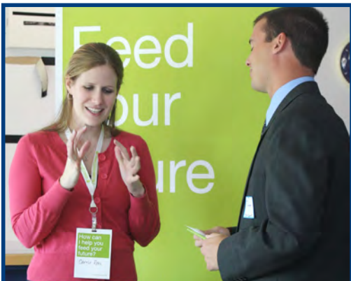
Connect with employers at our "Meet the Accounting Recruiters" Fair