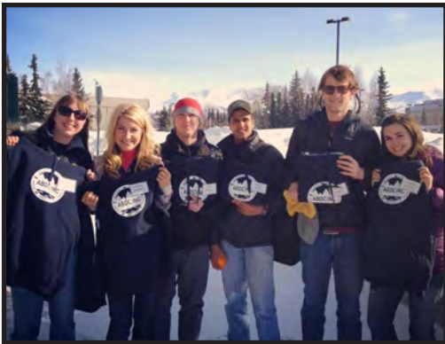
Accounting student volunteers help prepare taxes in Alaska.