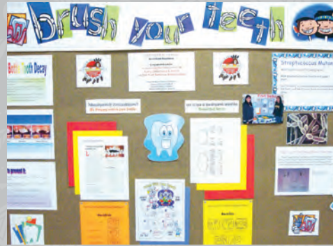
Left: With some playful interaction, a boy on the Fort Belknap Reservation learns the importance of good oral hygiene. Right: Students at Aaniiih Nakoda College have developed a wide range of educational materials for ECC prevention.