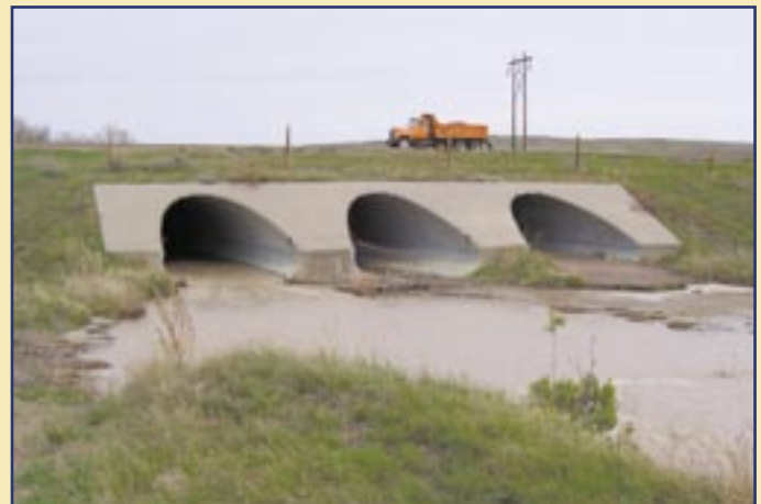
BELOW: Many culverts in eastern Montana are sized to handle large storm runoff, while most of the year the stream is just a trickle.