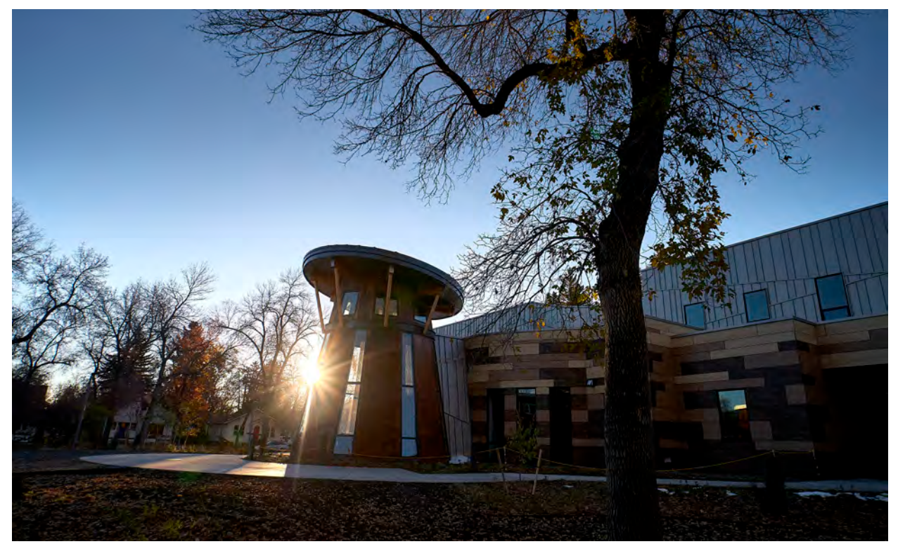
MSU's new American Indian Hall

Facilities Services provides a voluntary call-out program to provide maintenance services during afterhours, weekend, and holiday periods. For security considerations, if an employee is called in to assist with after-hours maintenance issues, the employee checks out master keys at the University Police Station where their name, date and time of key checkout and check in are recorded or uses personally identifiable Cat Card with the supervisor's permission.