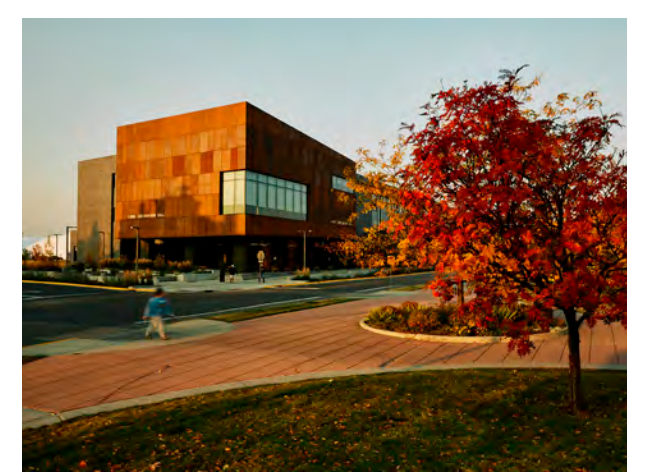
Norm Asbjornson Hall