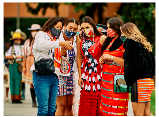
American Indian Heritage Day fashion show

The table below lists the various fire drills conducted in 2021, as well as a list of on-campus residential and academic buildings and their current fire/life safety status.