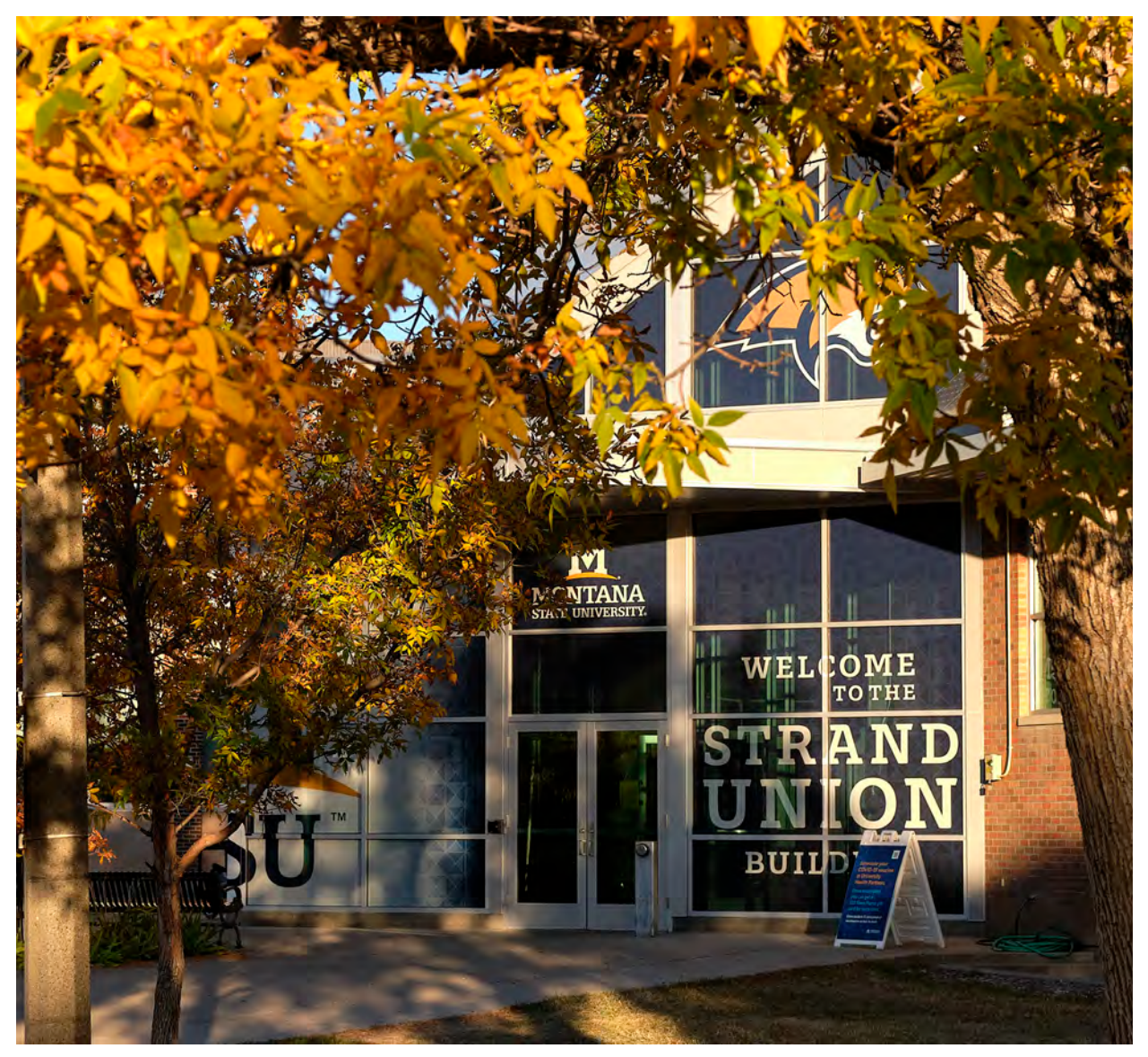
Strand Union building

For additional information on emergency actions and evacuation procedures, visit: <u>https://www.montana.edu/emergency/emergency_actions/index.html</u>