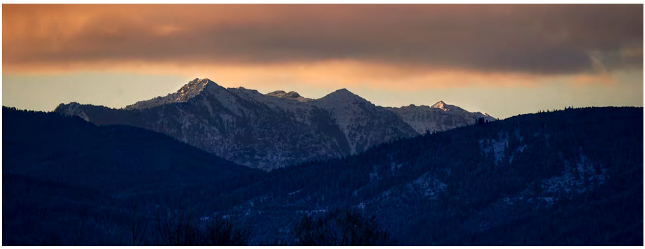
Gallatin Range, south of Bozeman

• The fire alarm system within Madison Hall and Jefferson Hall is planned for replacement in the summer of 2023.