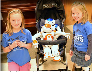
Two students with Ocean and Looney from Kootenai Valley Christian School, Libby.