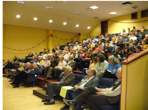
Fall 2011 Conference

We hope you will join us for the 2012 conference.