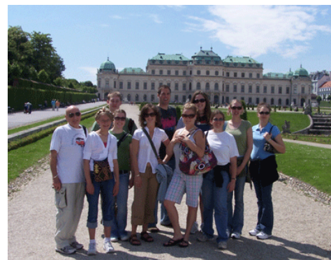
MSU Honors Program Great Expedition course "Money and Music"