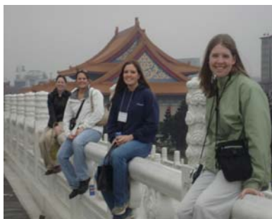
Follow the Grain students in Taipei