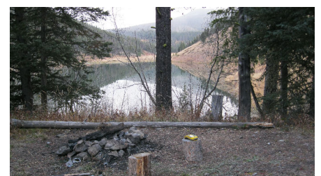
Campsite located at the southeast end of the lake