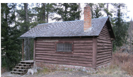
Mystic Lake Forest Service Cabin