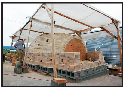
Wood burning kiln located at MSU graduate studios. Kiln built by MSU graduate student