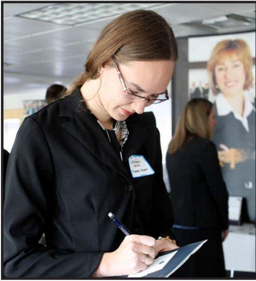
Accounting student at a recruiting event