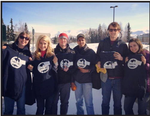
Accounting student volunteers help prepare taxes in Alaska.