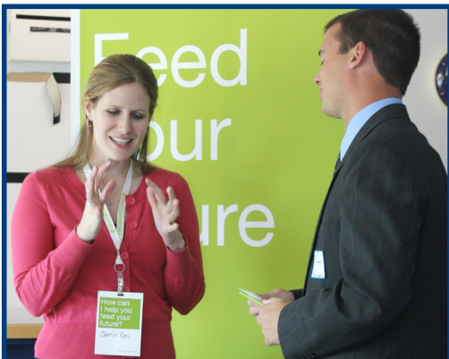
Connect with employers at our "Meet the Accounting Recruiters" Fair