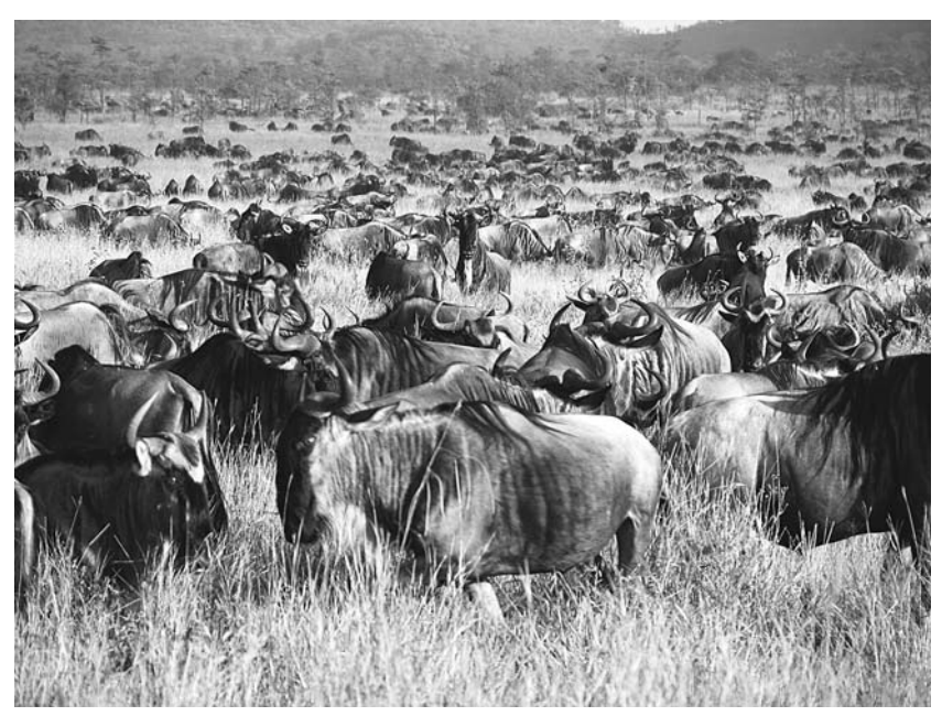
PLATE 1. Serengeti National Park, Tanzania, was designed to include most of the migratory range of the Serengeti wildebeest herd. Many other protected areas include only a portion of area required by migratory species. Wildlife in such protected areas is especially vulnerable to land use intensification on the surrounding lands.

Plate 1). Although Serengeti National Park is insufficient to maintain the wildebeest and other migratory mammals within it, the network of wild and semi-wild public and private lands across the Greater Serengeti Ecosystem may be nearly large enough to maintain these populations (Packer et al. 2005; but see Serneels and Lambin 2001). The Greater Everglades Ecosystem has been defined to encompass the massive contiguous area of freshwater slowly flowing seaward in southern Florida. Everglades National Park includes only a portion of this large watershed and ecological processes within it are strongly influenced by unprotected lands higher in the watershed (NAS 2003). The Greater Yellowstone Ecosystem, including Yellowstone National Park, was defined largely by gradients in topography, climate, and soils, and the resulting movement of wildfire and organisms (Keiter and Boyce 1991, Hansen et al. 2002, Noss et al. 2002). Centered on the Yellowstone Plateau and surrounding mountains, natural disturbance regimes and organisms move across the elevational gradient from valley bottoms to high mountains in response to climate and vegetation productivity (Fig. 2). In these cases, knowledge of the spatial domain of strong ecological interactions between protected areas and the surrounding areas has allowed for specification of the larger effective ecosystem. The term "greater ecosystem" is often used to describe these protected-area-centered ecosystems (Keiter and Boyce 1991).