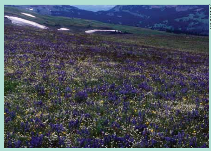
How will fragile alpine communities be impacted by expected climate-related changes?