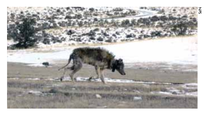
Sarcoptic mange (or "scabies") is an infectious skin disease caused by a mite. It was intentionally introduced in the western United States in the early 1900s as a biological control of wolf and coyote populations, and has been present in Greater Yellowstone coyotes ever since. It appeared in wolves outside of Yellowstone National Park in the early 2000s and now affects wolves inside the park.

Using these criteria to qualitatively filter these issues, we developed a suite of GYA science priorities that were identified for each driver and then a set of questions that integrated multiple drivers (see sidebar).