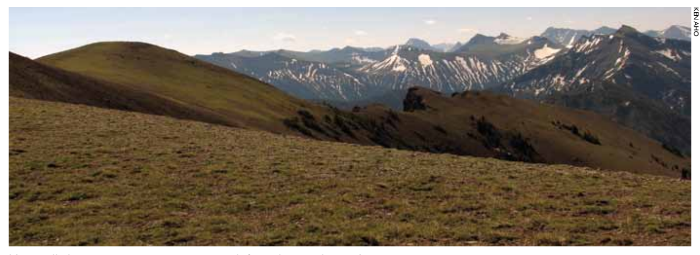
How will alpine vegetation communities shift as climate changes?

article in Yellowstone Science , including guidelines to link scientific tools such as research studies, scenario planning, vulnerability assessments, and long-term monitoring with management approaches and adaptive management into an integrated resource management program.