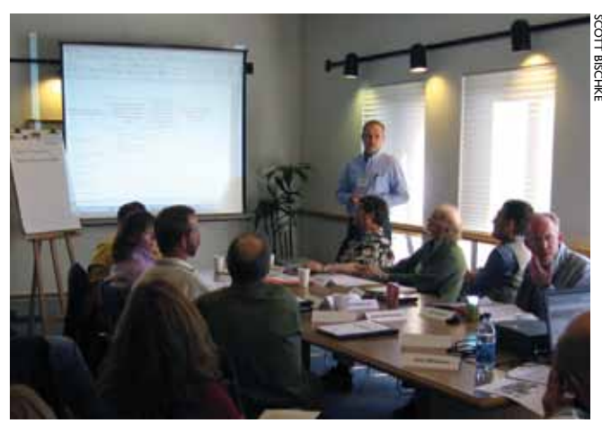
Approximately 90 land managers and experts attended the November 2009 "Climate Change, Invasive Species, and Land Use Change as Drivers of Ecological Change in the Greater Yellowstone Area: A Workshop to Identify Priority Science and Implementation Strategies" at Montana State University.

The GYA covers roughly 18 million acres in three states (Wyoming, Montana, Idaho). The region is often described as the largest intact ecosystem in the lower 48 states, with Yellowstone and Grand Teton national parks at its core. Some 75% of this land area is in public ownership, including national parks, national forests, national wildlife refuges, and Bureau of Land Management land. One of the