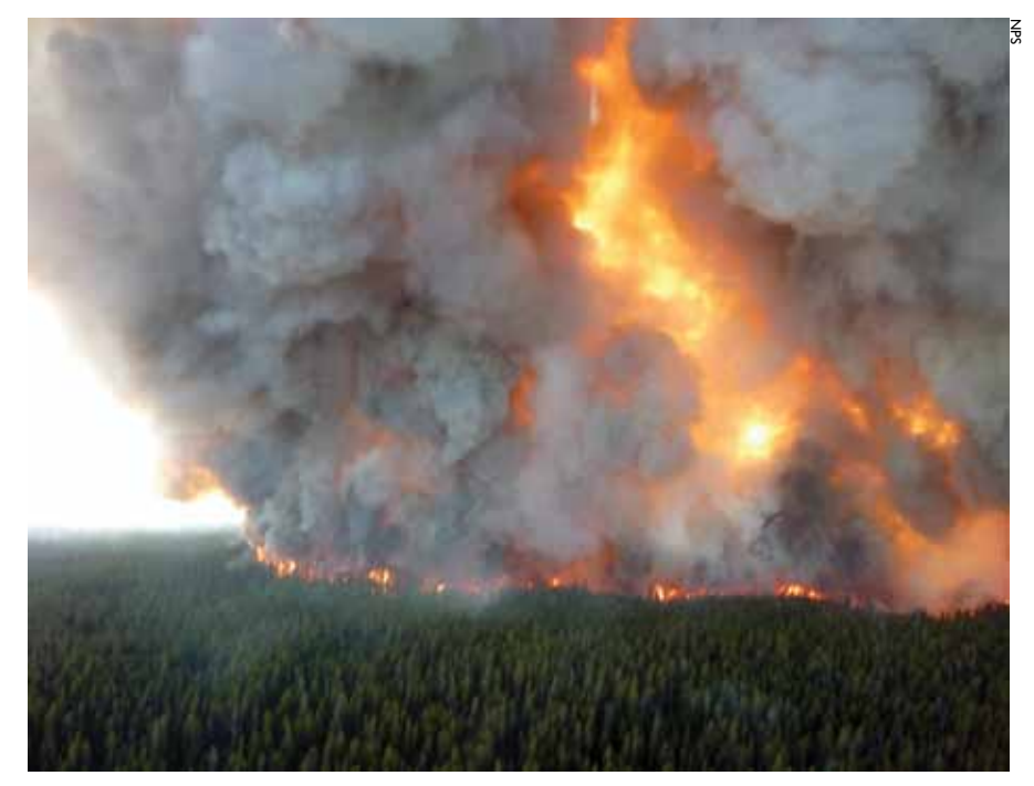
Rapid climate and associated ecosystem transitions in the Rocky Mountains have occurred in the past and will likely occur in the future. Projections include a higher frequency of large fires, longer fire seasons, and an increased area of the western US burned by fire.

The final step is to identify the highest priority science questions by key drivers. We anticipate working closely with members of the Great Northern LCC and other conservation partners to develop a framework for conservation action in the near future. This framework will help us prioritize the most important questions and allow for key research to be initiated. We anticipate that we will customize the framework for the GYA to take advantage of local opportunities for funding and research collaboration.