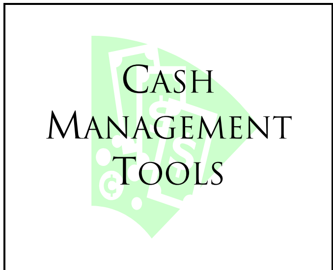
DIAGRAM #1: SLIDE 1—TITLE