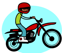
Motorsports are popular in many Montana regions.

Fishing and hunting lodges are important businesses to Montana