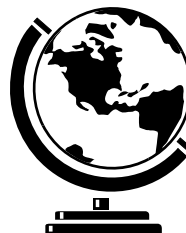
Travel and Tourism move people and promoting travel worldwide.

struction, design, and landscaping employees whom create and maintain the buildings that the hospitality businesses are in.