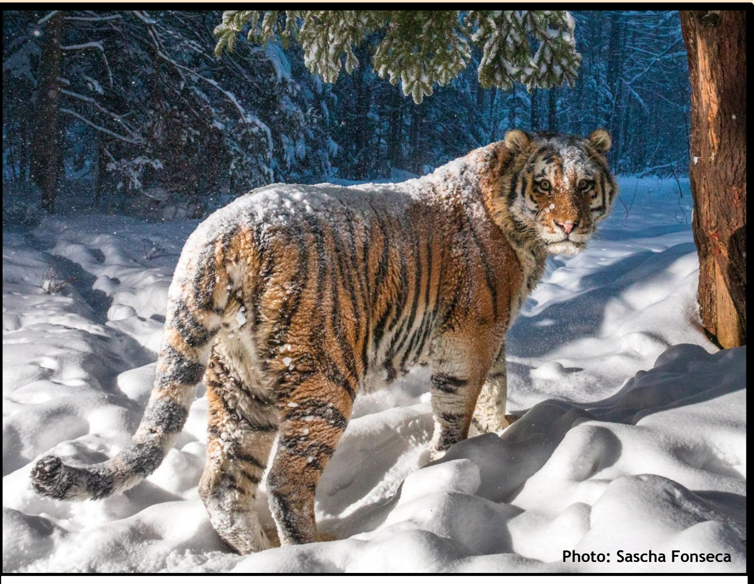
Large male Amur tiger caught on camera trap in the Russian far-east