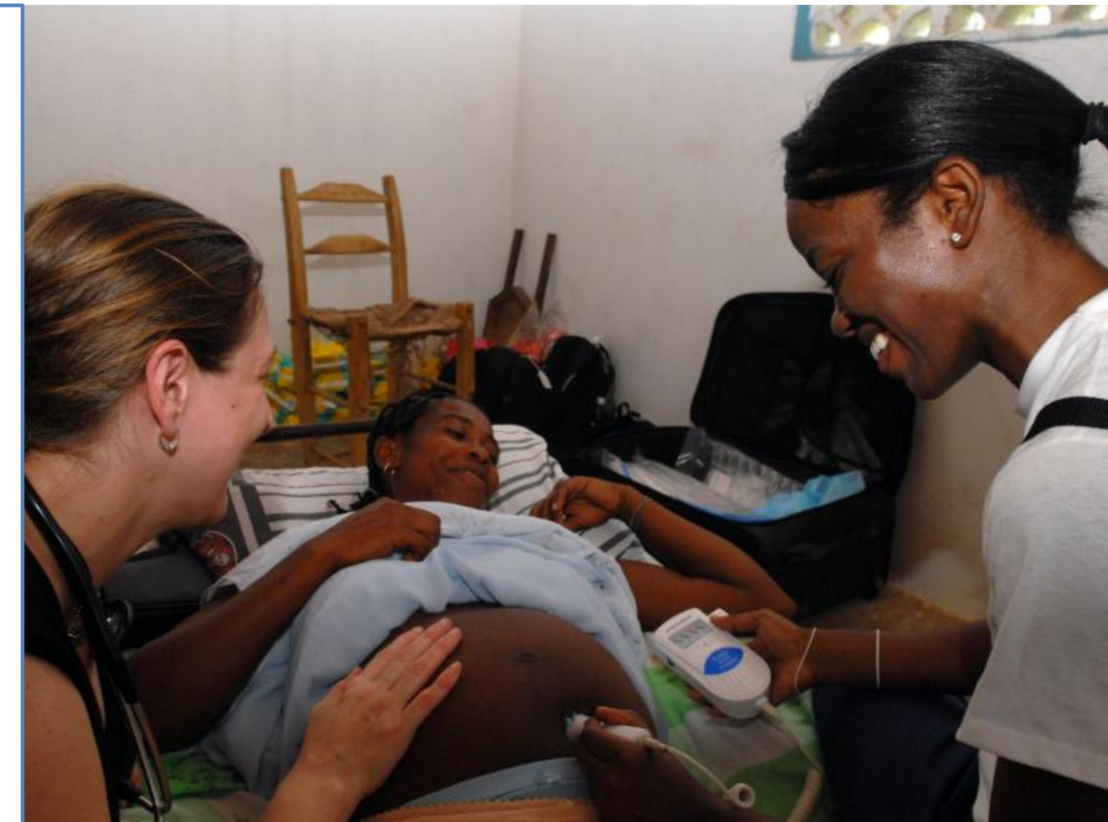
Left: Pregnant woman being examined by healthcare workers at Albert Schweitzer Hospital, Des Jardins, Haiti.

Methods: I chose Albert Schweitzer Hospital as a community of focus because I had a relative working there interested in engaging in a holistic discussion with me, and I myself will be working there later this year. The research idea emerged from the discussion regarding the main issues interrupting the community's Desired Quality of Life. Together we developed these questions. An Expedited Review was approved April 2015 by Albert Schweitzer Hospital and MSU.