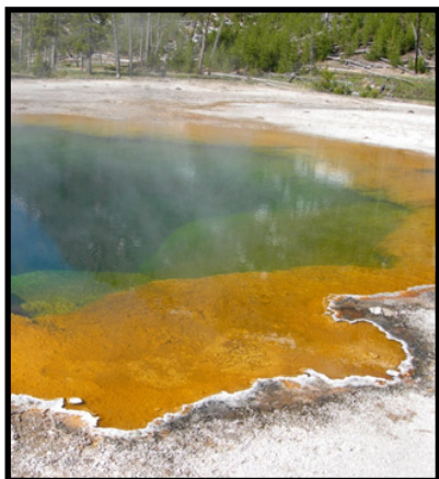
Yellowstone National Park

Department of Microbiology Graduate Program Office Contact Information: