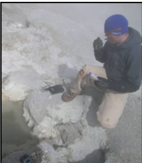
Yellowstone National Park