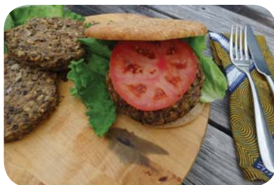
The Mission Mountain Food Enterprise Center's lentil patty is made with all Montana ingredients (lentils, oats, barley, organic eggs, flax seed, bell peppers, onions and carrots) and fulfills protein requirements for Child Nutrition Programs.

To learn more about Mission Mountain Food Enterprise Center, visit www.mmfec.org or call (406) 676-5901.