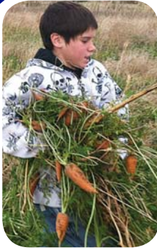
A student helps harvest an armload of carrots in Red Lodge.