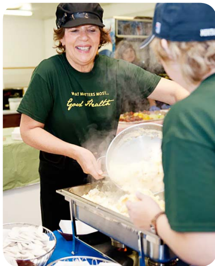
Food service staff prepares the banquet line at Livingston Healthcare Center.

Farm to Hospital programs are gaining ground nationwide as fresh, local food plays an increasingly vital role in hospitals' missions to improve the health of their patients. In addition to purchasing and serving local foods, a few Montana hospitals have introduced other innovative models for incorporating local food in their institutions. One model is to host farmers' markets on hospital campuses, while another is to provide employees with Community Supported Agriculture (CSA) shares. Unlike schools and universities, hospitals— as well as nursing homes and senior living facilities—consistently serve food year-round, including during the peak growing season, making them a great market for local producers. Healthcare facilities tend to be price-sensitive and purchase the majority of their food through broadline vendors, though they have the ability to buy Montana food products through those contracts as well as directly from area producers.