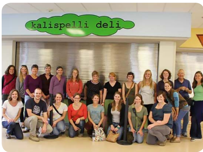
Montana's 2012-2013 FoodCorps and AmeriCorps VISTA members at a September 2012 Training.

To learn more about FoodCorps, visit https://foodcorps.org/montana .