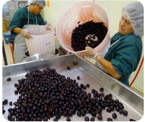
Staff at Mission Mountain Food Enterprise Center prepare Flathead cherries to be frozen.

In Montana, a majority of produce farms will be eligible for an exemption from FSMA, so institutions and distributors are increasingly looking to the USDA's Good Agricultural Practices (GAP) and Good Handling Practices (GHP) for safety guidelines asked of farmers to minimize health risks associated with growing and transporting produce. Some institutions and food buyers may require GAP certification though most in Montana don't. They may, however, require an on-farm food safety plan or simply give preference