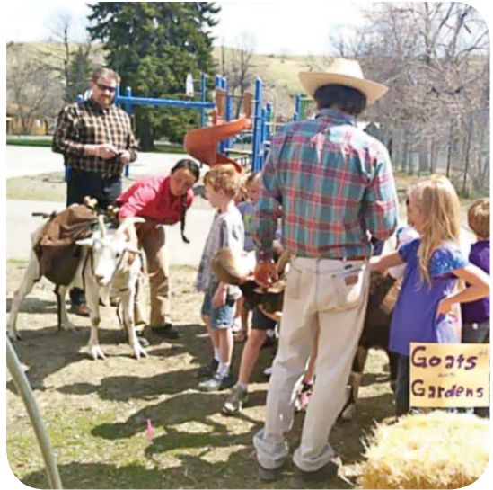
Hands-on education is a priority of the Gallatin Valley Farm to School group.

FoodCorps members have also been central to getting us established. Though we have had plenty of