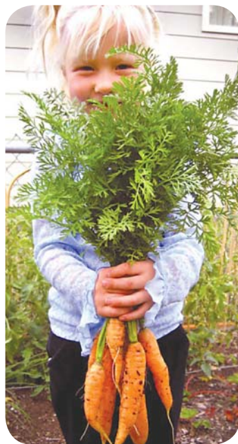
A student shows off her harvest.

Getting buy-in from the food service personnel can be a slower and more challenging process that will depend on the staff and policy or encouragement of school board and superintendent. National Farm to School Month in October can be a good starting place to garner support.