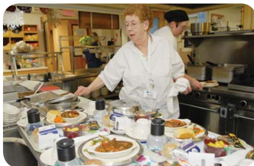
A kitchen staff member prepares a local meal at Livingston Healthcare Center.

In 2015, LHC built a new facility. The new healthcare campus remains a critical access hospital with 25 beds, but with an expanding service line. The cafeteria has taken on a new image and a new brand; Café Fresh aims to become one of the most sought after destination eateries in SW Montana. “As a manager at LHC, I had a lot of input in to the design of Café Fresh. I had a secret mission in mind. To feature the culinary arts