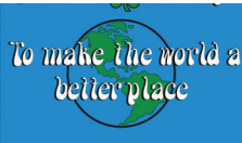
2010 t-shirt design

Are you artistic? Have you looked at the Sanders County 4-H incentive t-shirts in the past and thought, "I could do that!" Now is your chance! All Sanders County 4-Hers are invited to submit a design that refers to 4-H. The winning designer will receive a prize and get to see his/her design on t-shirts around the county. Get creative and submit your entry (or entries) to the Extension Office by the council meeting on January 25th. We are looking forward to seeing the entries.