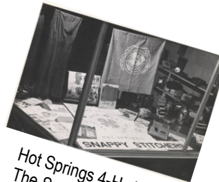
Hot Springs 4-H club The Snappy Stitchers

Please scan and e-mail submissions to jep@midrivers.com . Include with the email any additional information about the photo. If you have photos you would like to submit, but do not have access to email or a scanner send to or drop off at the Extension Office.