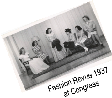
Fashion Revue 1937 at Congress

Montana 4-H is preparing to celebrate the 100th year of 4-H in 2012. The planning committee requests leaders, past leaders, and alumni to submit photos, which will be put in a slide show video.