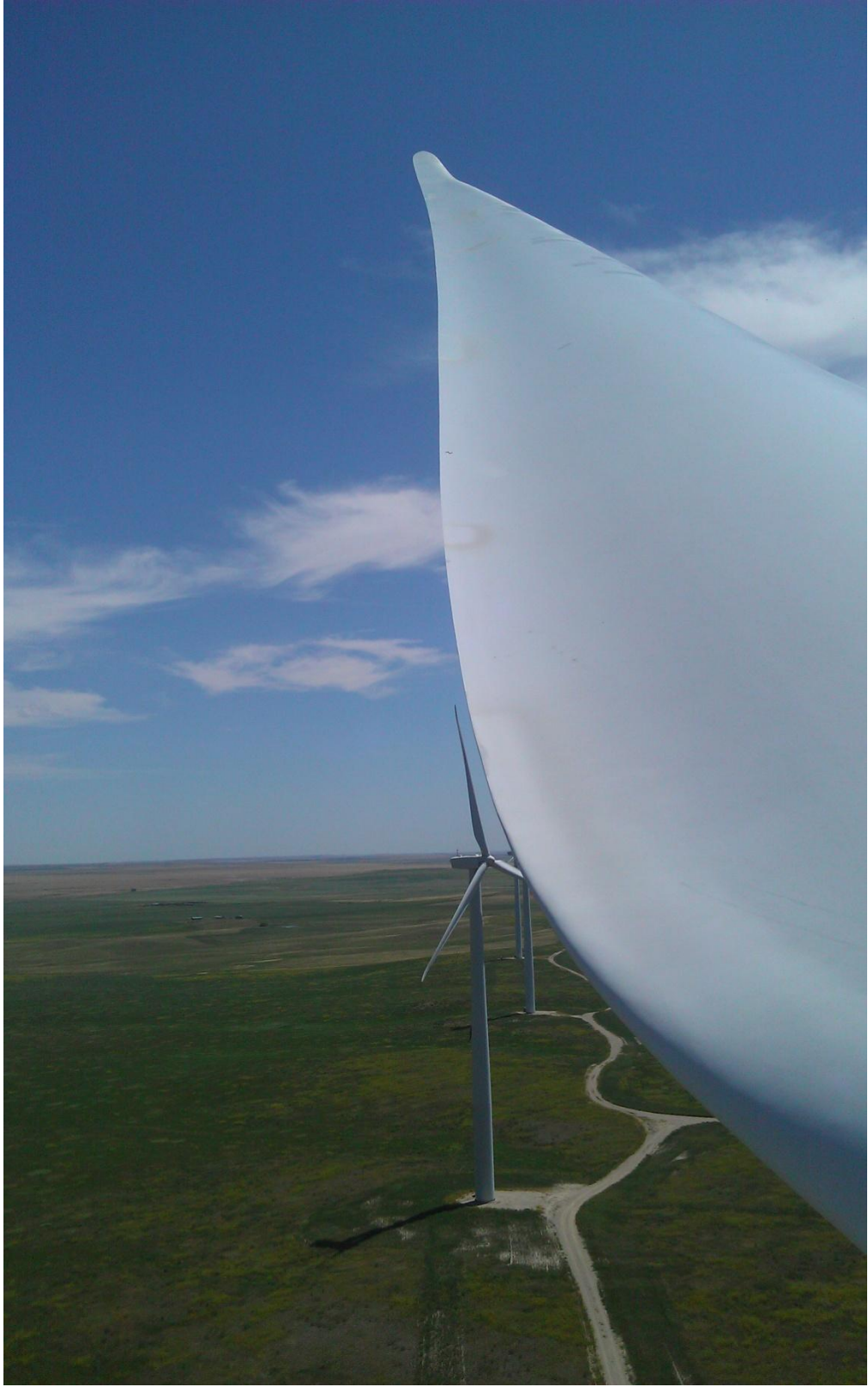
Montana at its finest