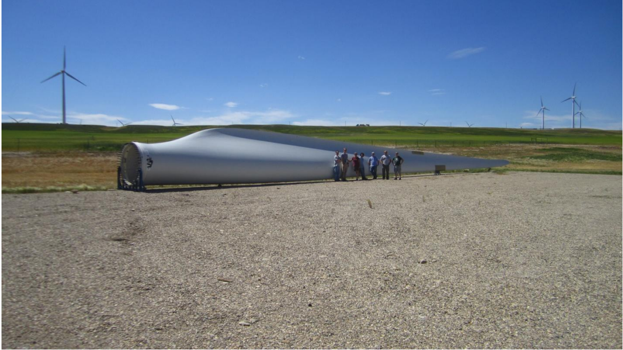
A little perspective...