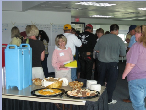
Parents enjoy some camaraderie during the Family Reception at summer orientation.

I wanted to take this time to welcome you (or welcome you back ) to Montana State University! I see numerous amazing stories of student success on our campus and I feel extremely fortunate to work with you and your students on a daily basis.