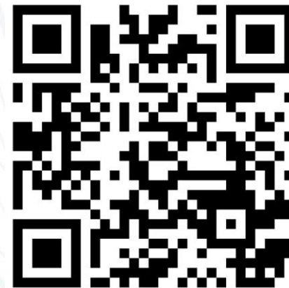
POLITICAL SCIENCE DEPARTMENT