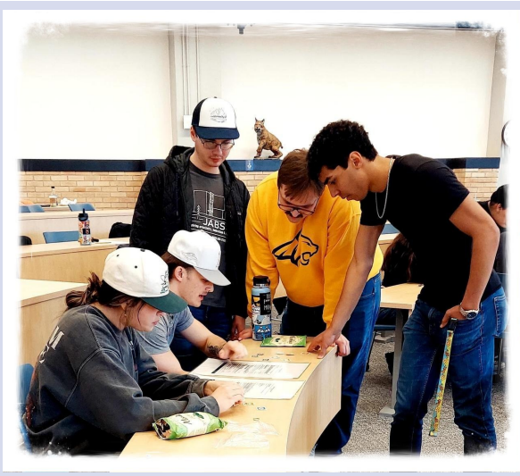
Scholars work together to identify and strengthen their NACE Competencies.