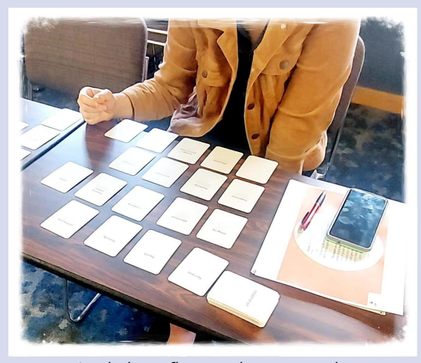
A scholar reflects on her personal values and principles.

Did you miss out on the "Know Your NACE" and