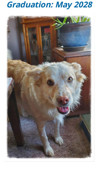
Moriah Schutt Sustainable Foods & Bioenergy Systems