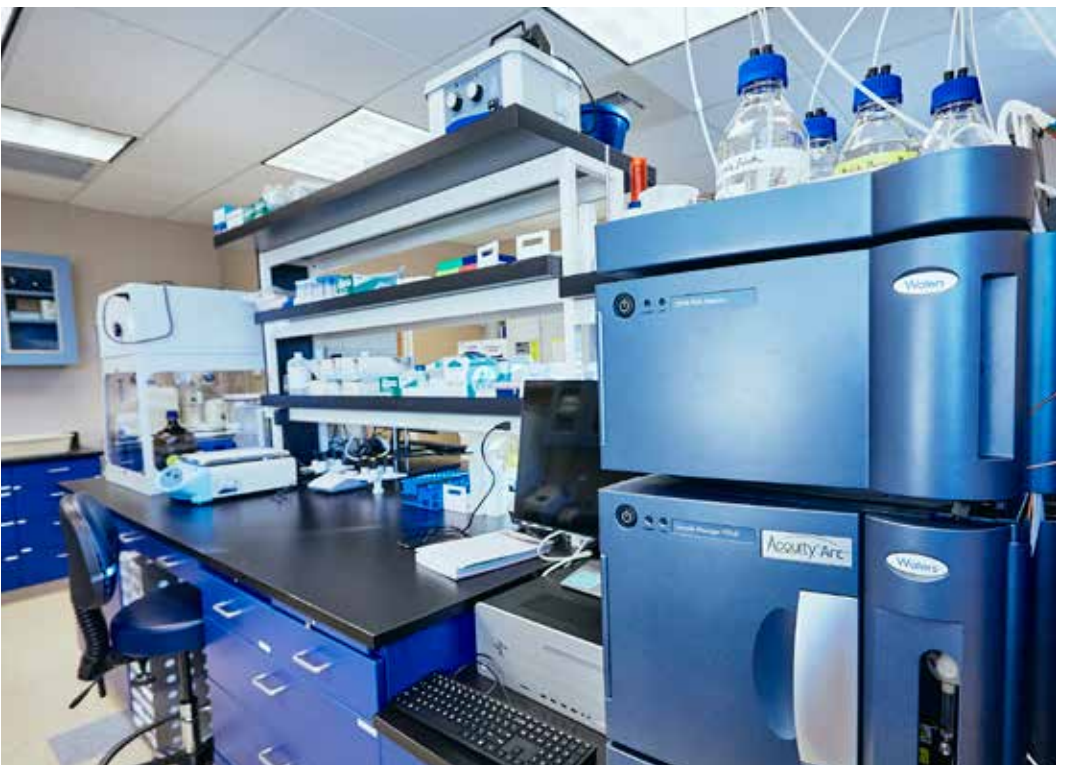
The Translational Biomarkers Core Lab, launched just this year, provides state-of-the-art services to assess a wide range of biomarkers.

CAIRHE is part of the Institutional Development Award (IDeA) program at the National Institute of General Medical Sciences division of the NIH under grant award number P20GM104417.