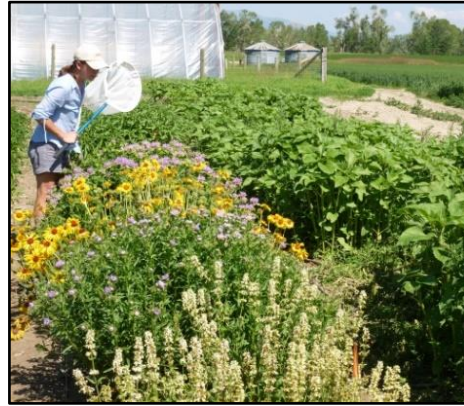
Figure 4. Sampling wild bees from a flower strip in early July.

Economic analysis. We recorded all costs associated with harvesting and cleaning seeds, as well as those associated with establishing and maintaining flower strips over three years, and compared this to the potential revenue from seed sales based on current market values. The cost to establish a flower strip of the same size used in our research is between $200-$560 for plant materials, depending on whether plugs are purchased wholesale or retail, plus labor to plant and weed during the first growing season. The latter varied from $45-$130 per farm (calculated at minimum wage), depending on the use and type of weed barrier and weed pressure. Weeding costs in the second and third growing season ranged from $22-$165 per farm. Our analysis indicates that revenue from native wildflower seed sales could exceed the costs associated with establishing and maintaining flower strips by the start of the third growing season. Profits, however, varied greatly by plant species and farm, indicating that some species may be more profitable to grow for seed than others and that farms vary considerably in seed yields, likely due to factors including local climate and farm management methods.