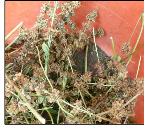
Figure 5. Tub filled with P. confertus stems and seed collected in September.

Benefits of flower strips. The suite of plant species in our flower strips provided food resources for a diverse and abundant community of wild bees present on and around farms, strengthening the value of these plantings for promoting pollinator conservation. In addition, harvesting seed from flower strips for sale has the potential to be profitable and pay for costs associated with its' establishment, adding an additional economic benefit. We hope these findings encourage greater adoption of this promising on-farm management strategy.