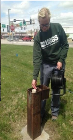
Surveying channel cross sections (above), measuring depth to water in well (right).