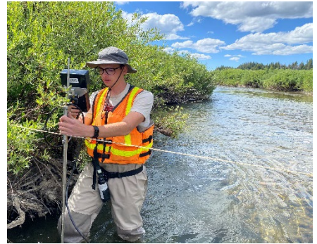
Measuring streamflow at Blackrock Creek near Moran streamgauge.

What do we do? Collect surface-water, groundwater, and water-quality data, and conduct water- and ecosystems-related scientific investigations.