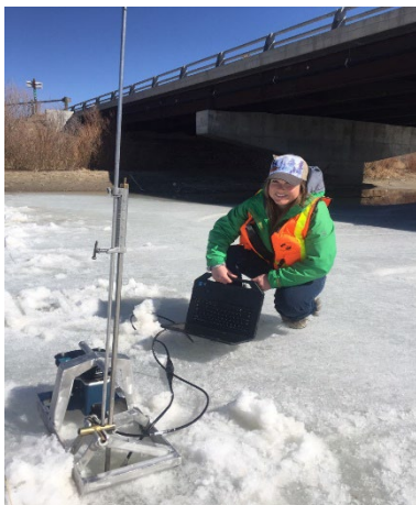
Measuring streamflow under the ice using hydroacoustic equipment (left).

on Twitter and Instagram: @USGS_WY and @USGS_MT