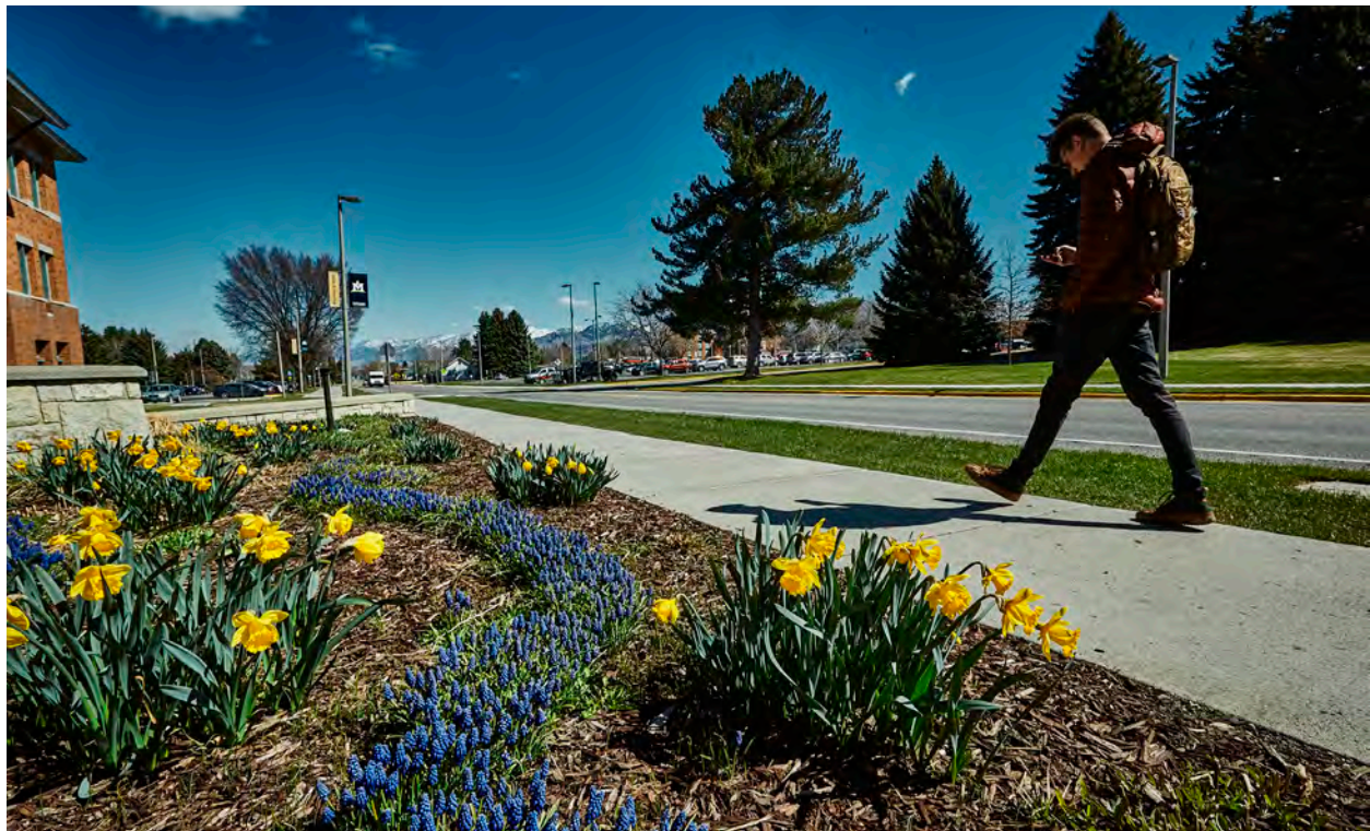
Flowers bloom on MSU's campus in spring 2021

Except as provided in 50-32-609 or Title 50, chapter 46, it is unlawful for a person to use or to possess with intent to use drug paraphernalia to plant, propagate, cultivate, grow, harvest, manufacture, compound, convert, produce, process, prepare, test, analyze, pack, repack, store, contain, conceal, inject, ingest, inhale, or otherwise introduce into the human body a dangerous drug. A person who violates this section is guilty of a misdemeanor and upon conviction shall be imprisoned in the county jail for not more than 6 months, fined an amount of not more than $500, or both. A person convicted of a first violation of this section is presumed to be entitled to a deferred imposition of sentence of imprisonment.