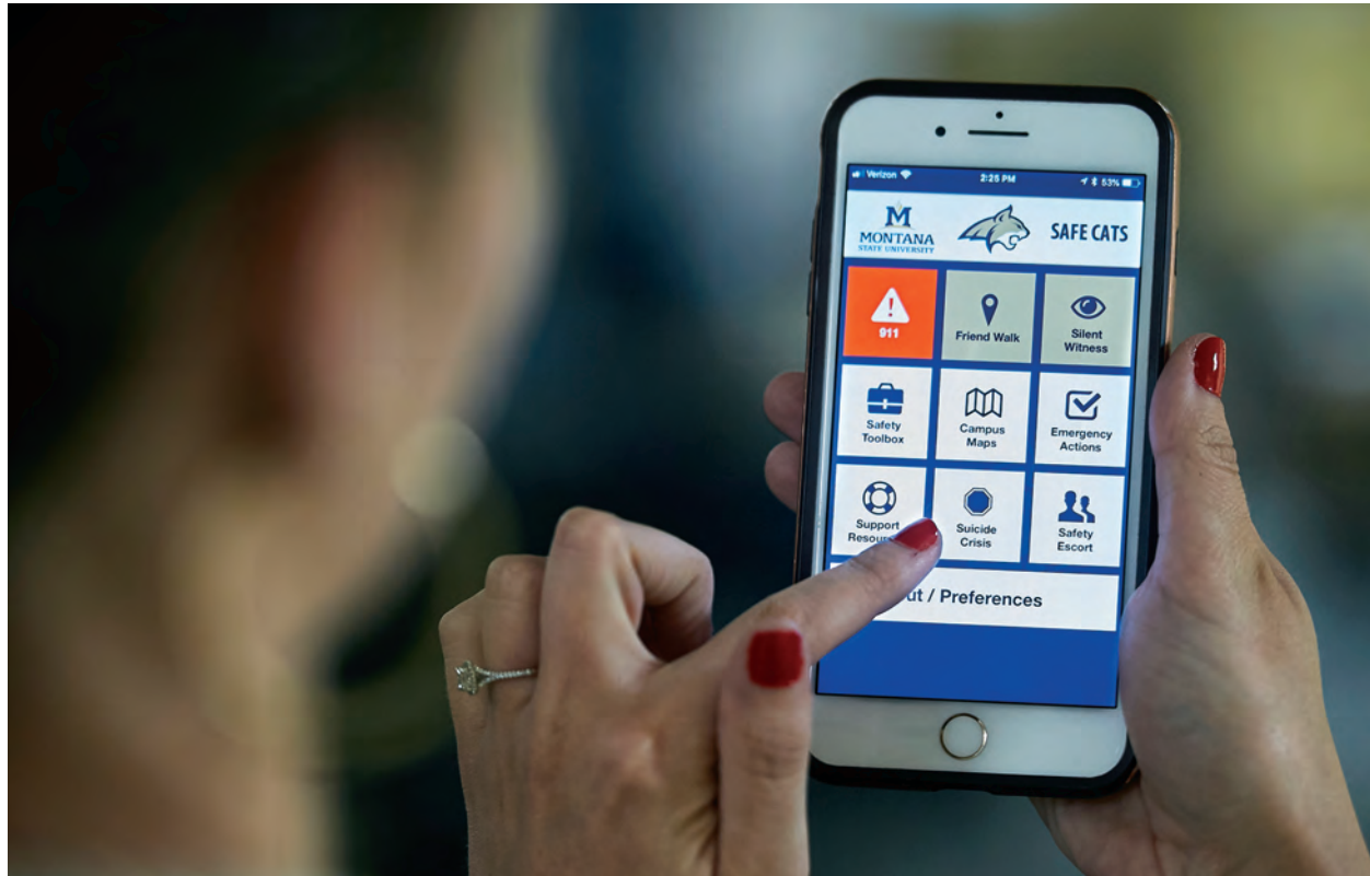
The SafeCats Safety App has been updated to include COVID safety information

SafeCats is a safety app that allows the user to contact police, request a safety escort, or to activate a Friend Walk in a single mobile application. The SafeCats app is available for both Android and Apple cellular phones and is available free of charge.