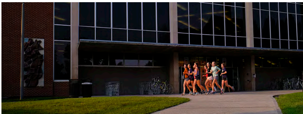
A group of students run on campus

Swingle First Floor; (406) 994-2311 http://www.montana.edu/health