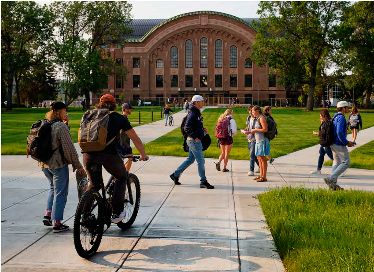
Romney Hall has been undergoing extensive renovations and will reopen in November 2021

Most officers hold a B.A. degree or are working towards a degree. The University combined its dispatch with the local County dispatch to provide more efficient and effective services. All County Dispatchers are trained and certified by the State of Montana. The Director is the University Police Chief and is responsible for the management of the UPD and reports directly to the Vice President of Finance and Administration. However, all public safety services are closely coordinated with other key university administrators as well as local officials.