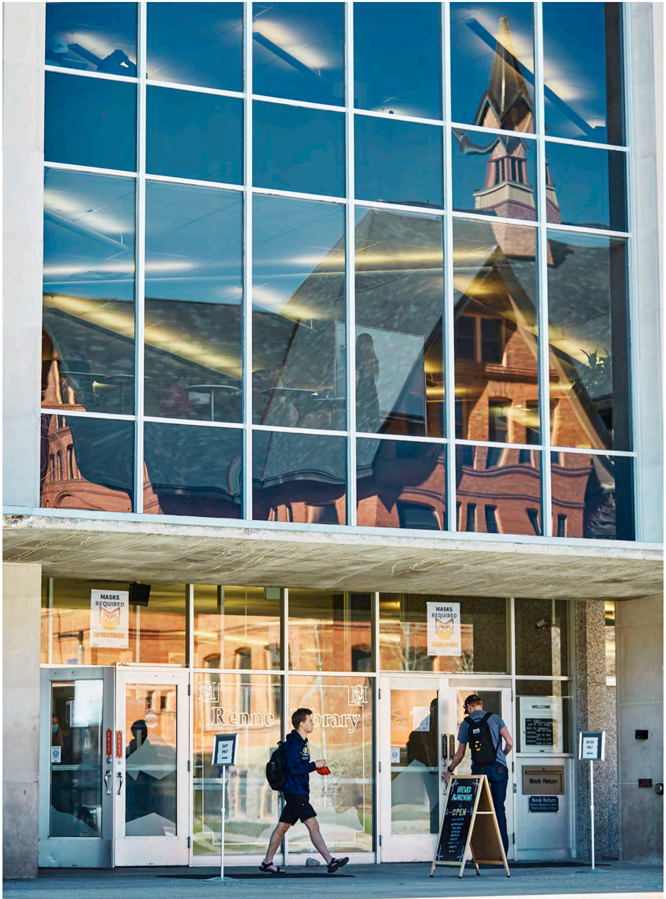
Montana Hall is reflected in the windows of the library