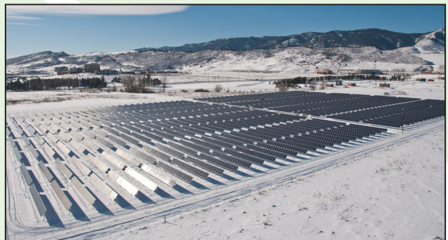
Two megawatt solar array at Chrisman Field

Colorado State University has already installed more than 5,500 kW of photovoltaic panels on their campuses. These systems include five small PV systems (totaling more than 236 kW) that contribute directly to reducing Colorado State's GHG footprint. The large 5,300 kW solar plant is owned by a third party. While the environmental benefits of that plant have been sold for the first 20 years, after that the benefits can revert to CSU and are accounted for in the long term of the CAP.