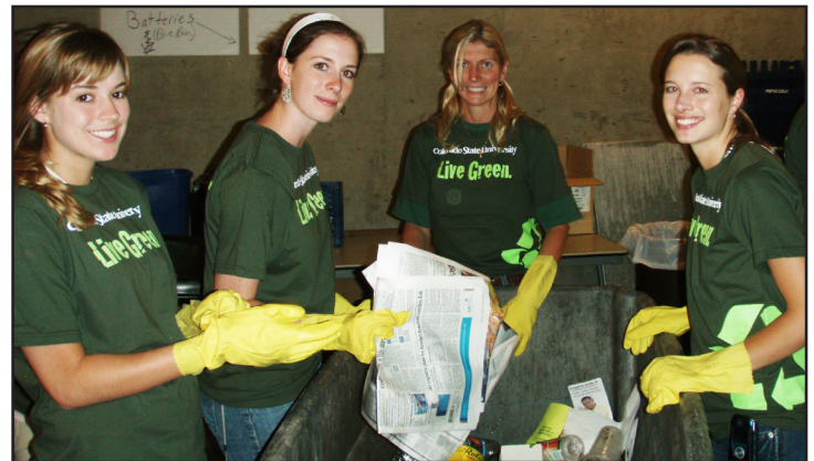
The Live Green Team coordinated volunteers to sort trash and recyclables at the Democratic National Convention.