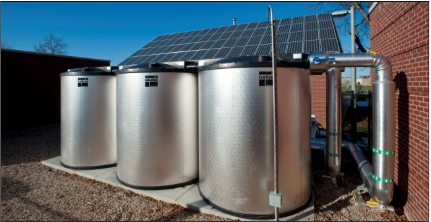
Thermal Storage Tanks & Solar Electric (PV) at the Academic Village Residence Hall