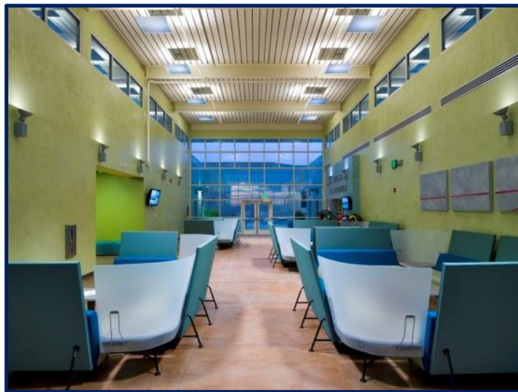
LEED Silver "Carlsbad Allied Health Building"