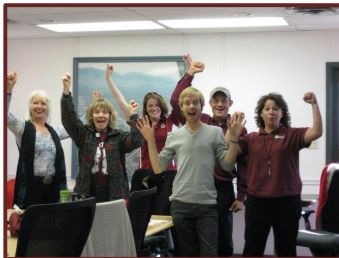
Volunteers that got us to STARS Gold!

We have modeled the committee structure of our Sustainability Council after these three divisions.