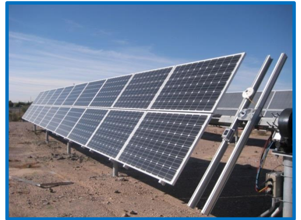
Solar panels at SWTDI test facility

SWTDI provides training and contract engineering services for systems analysis, hardware development and evaluation, and feasibility studies, and computer modeling, and informational kiosks. SWTDI performs contract engineering for a wide variety of private and public sector clients, including research organizations, utility companies, and local, state, and federal government agencies. Ever changing and developing as needs for research and outreach change, in 2011 SWTDI became part of the Klipsch School of Electrical and Computer Engineering.