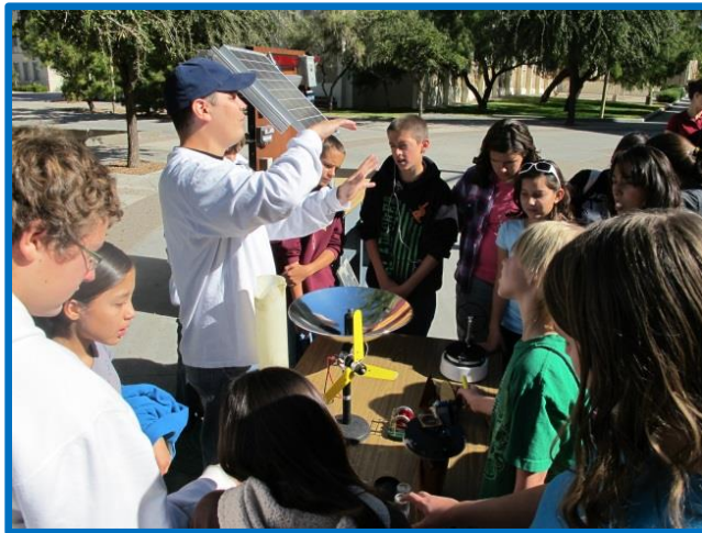
Faculty teaching grade school students about solar

The Institute for Energy and the Environment includes WERC, a consortium for environmental education and technology development, Southwest Technology Development Institute, a renewable energy research and development group, and Carlsbad Environmental Monitoring and Research Center, a nuclear waste-management and monitoring center.