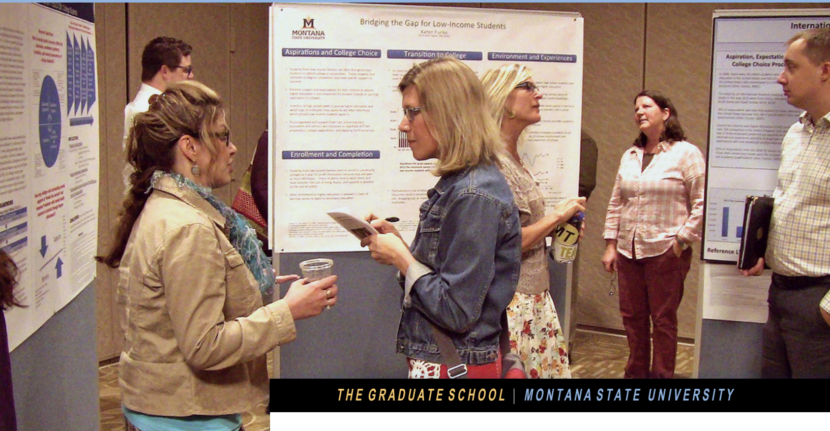
THE GRADUATE SCHOOL | MONTANA STATE UNIVERSITY