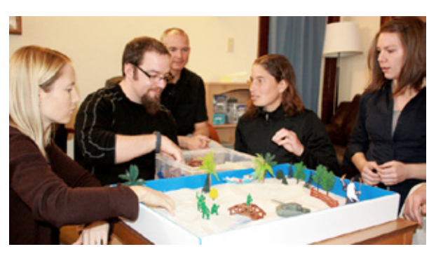
Above: Counseling students learn about Sand Tray Therapy