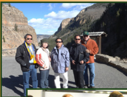
Thai educators tour Yellowstone National Park with MSU friends.