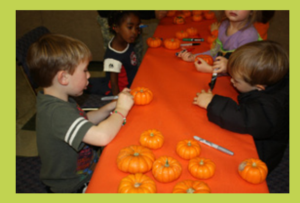
Children from MSU's Child Development Center paint pumpkins.

In conjunction with a nationwide celebration for healthy, sustainable food, HHD students in Nutrition 321 and the Montana Student Dietetics Association held Food Day on October 31 in the SUB Ballrooms. Students created a variety of fun activities and booths to educate attendees about healthy foods, nutrition, gardening, and sustainability. Since the event was held on Halloween, many of the foods focused on healthy snacks, such as edible eyeballs and witches' fingers. At noon, "The New Green Giants" film was shown in the Procrastinator Theater, followed by a panel discussion sponsored by the Sustainable Food and Bioenergy Systems Collaborative (formerly Friends of Local Foods).