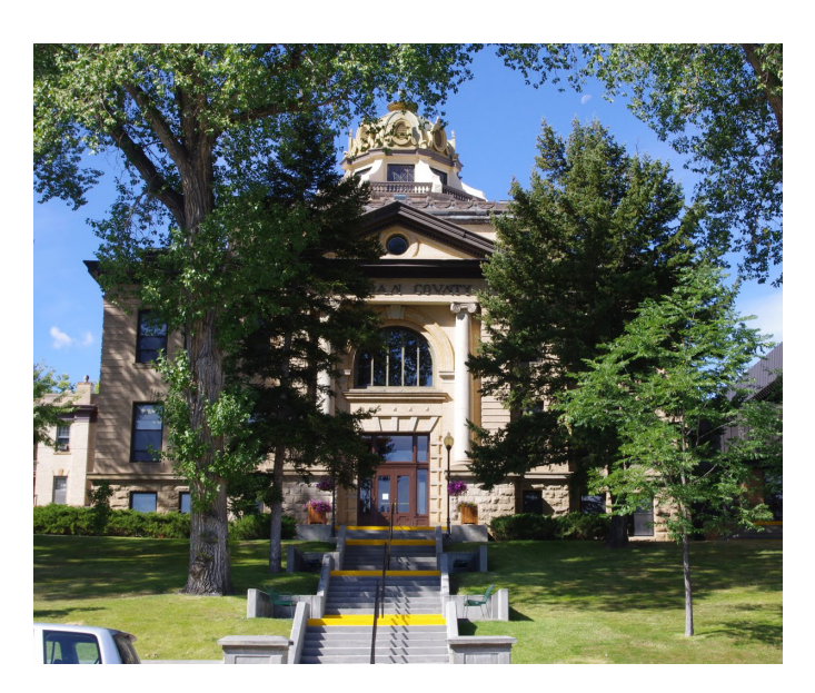
Figure 2. The historic Sheridan County Courthouse in Wyoming.

The assembly of diverse stakeholders in a nonpartisan environment enables sharing of resources and contact information, exchange of lessons learned, communication among landowners and between industry operators Through and local stakeholders. exchanges, misinformation can be avoided and local governments can assist one another and receive assistance (financial and otherwise) from industry. Despite the Coalition's best efforts, the PRB is still facing challenges today, specifically around reclamation. But post-development issues were never the CBMCC's top priority, although, in hindsight, some participants had wished they were. Learning from and analyzing the activities and efforts of the Coalition have helped to illuminate what is truly most useful to local policymakers, agency officials and the public in energy communities - and that simply is the importance of creating a structured space for stakeholders to come together and collectively learn from one another.