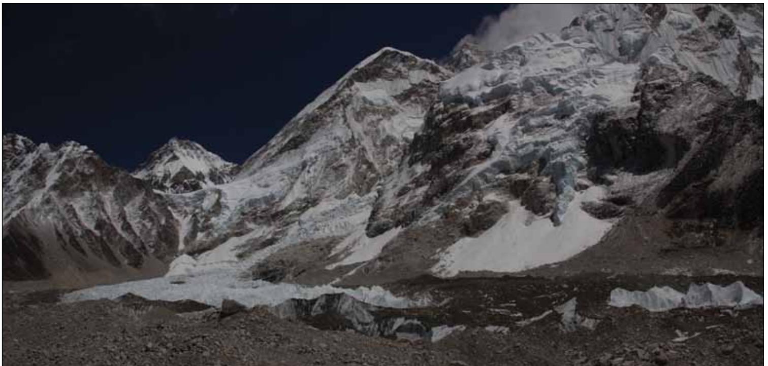
Everest and the Khumbu Glacier. Base Camp is to the left of the glacier.