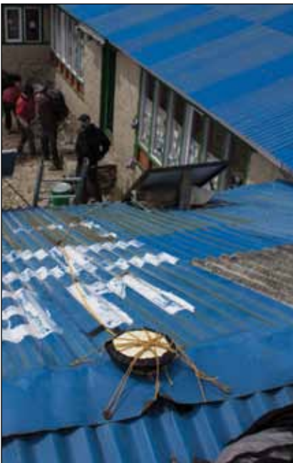
Receiver mounted on teahouse roof.