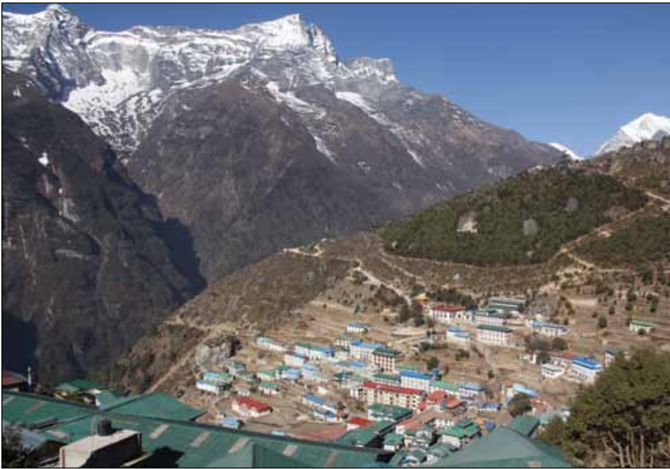
Namche Bazaar.