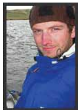
May 24, 2012 Everest Base Camp, Nepal By Travis Corthouts

Well, just as I was about to leave the communication tent for the day and hit the trail for Gorak Shep, a guide from another expedition stopped