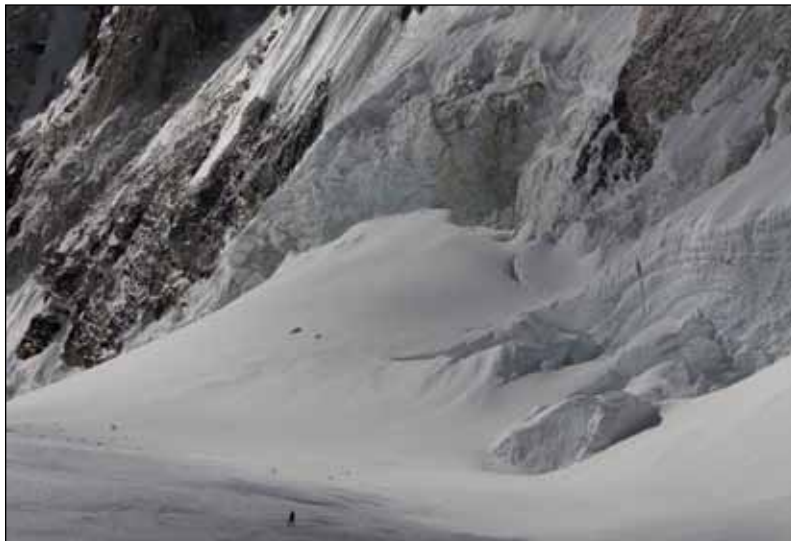
Climber in the Western Cwm on the way to Camp 2.

April 16th was a delightful day in the upper Western Cwm. It was sunny and clear throughout the day (what a delight compared to the previous day!) and I hiked to the base of the Lhotse face, looking for interesting rocks and marveling at the fantastic folds and faults in the lower Yellow Band marbles below the steep ridgeline between Lhotse and Nuptse. Of course, Everest towered above me all day long, with white granites at her base, overlain by dark metamorphosed pelites (Everest Series) and the distinct upper Yellow Band higher up (encircling Everest like a gold wedding ring) – all capped by gray, marine, fossil-bearing limestone beds on the summit pyramid 8,000 feet (2438 m) above me! The afternoon sky remained crystal clear and I had the privilege of watching the rocks on Everest turn to darker, richer colors as the sun slowly sank somewhere over the western Himalaya – standing at the base of Everest at over 21,200 feet (6461 m), I was alone and lost in tectonic thoughts as the tallest mountain on Earth showed me her evening colors. The only sound was the roar of wind a few thousand feet above.