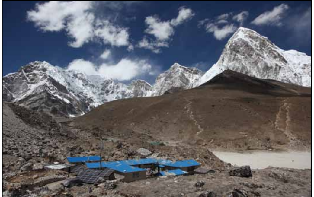
Gorak Shep.