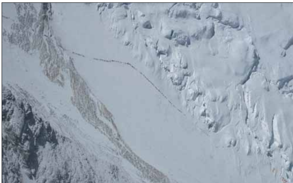
A line of climbers ascends between Camp 3 and Camp 4.

Also, we're not the only people to see this potential and we think those guides and Sherpas now up on the mountain will do everything they can to prevent this by making sure the ropes get fixed in time. The fact that nearly all other expeditions are going up right now is ac-