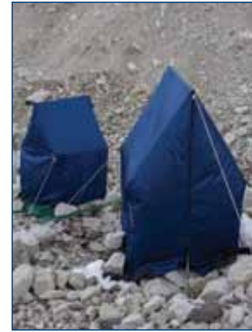
Bathroom tents at Base Camp.

· Yesterday afternoon it became cloudy and cold (no surprise) and it started to snow. I retreated to my tent for a snooze. By dinner time, several inches of fresh powder snow had fallen at camp and the sky was gradually clearing to reveal a beautiful, pastel blue sky with remnant wisps of clouds swirling among the peaks. The last rays of sunshine were focused on Nuptse, illuminating the summit like a spotlight. There is something special about that last bit of sunshine for the day and the way that “evening-shine” bathes the mountains and glaciers in golden light. Yesterday evening, the summit of Nuptse was a