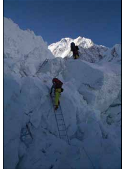
Khumbu Icefall.

I arrived at Camp 1 at the top of the Khumbu Icefall around 10:00 in the morning, making my first-time-ever transit through the icefall around 6 hours and 20 minutes – slow, but not totally disgraceful; it was a very aerobic workout! The morning was bright and sunny, so I rested in my Camp 1 tent, hydrated and ate some candy; by afternoon, it was cloudy, very windy and snowy (typical afternoon on the Khumbu Glacier – mornings can be a solar furnace, whereas afternoons and evenings are often windy and cold).