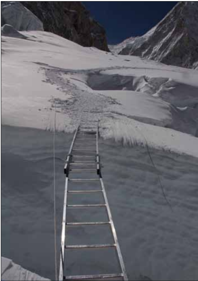
Ladder crossing on the way to Camp 1.

Although at the top of the Khumbu Icefall, Camp 1 is nevertheless surrounded by large and deep crevasses. One dare not wander around at night without a headlamp and a clear memory of the landscape, for fear of slipping into one of the crevasses. Interestingly, our outdoor latrine (carved out of snow) offers a spectacular view of gaping crevasses right below a steep slope on which the latrine is perched; this is no place to slip when dropping your pants in the middle of the night!