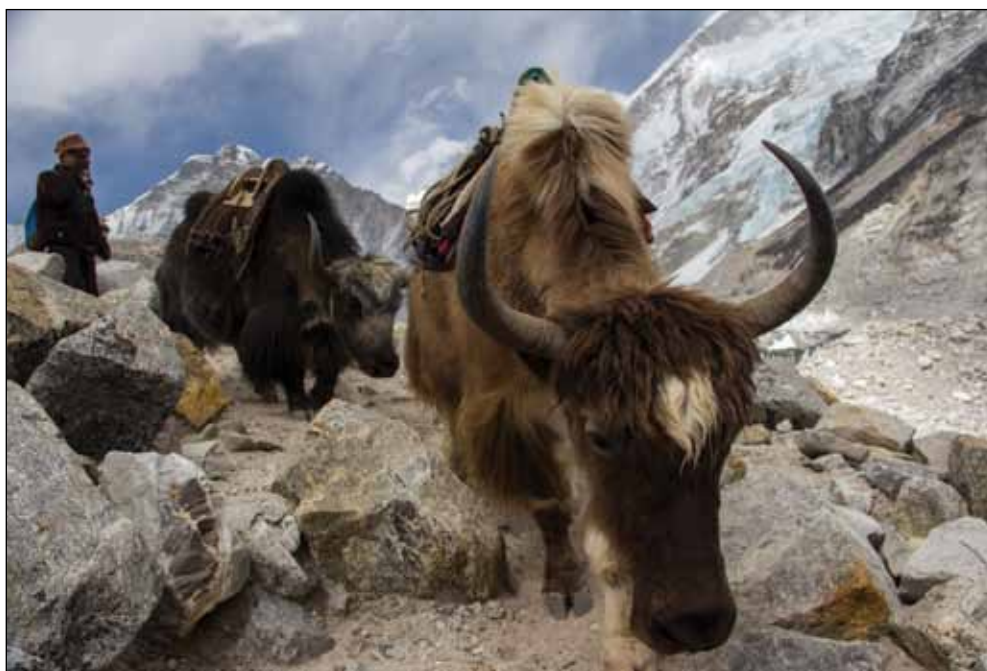
Yak train.

Yes, the weather is cold at night especially from camp 1 – 4 because it is very windy at night too. Above the South Col it's even very cold during the day. Between camps 1 and 2, when there is no wind, it can get up to 100° F (37° C) during the day because the sun reflects off of the valley walls, creating what we call the "solar oven." At base camp it's about 0° F (-17° C) at night and up to 55° F (12° C) during the day when there is sun and no wind.