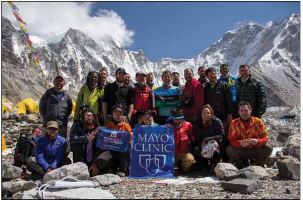
The Mayo Clinic team.