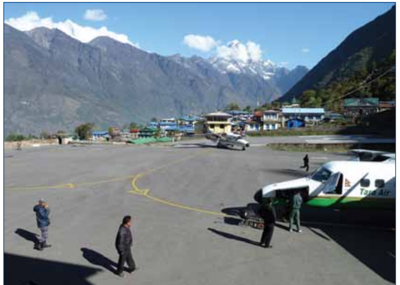
Airport in Lukla.

It's the end of the day now and we're staying at a teahouse