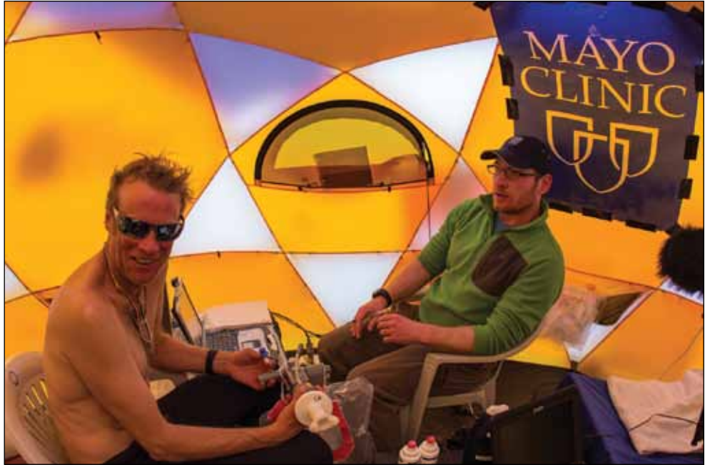
Conrad Anker's lung capacity is measured by Mayo Clinic researchers.

However, it's become clear there's a power supply issue with the GPS equipment in Gorak Shep and over the last two weeks I have been there several times to check on our equipment. I'm fairly sure I figured out the problem last time I was there and I've been negotiating with the teahouse owner over how to fix it. Either way, I know a lot more about solar power than I did before I began this journey. Troubleshooting the problem might normally be easy, but I'm in a remote place with almost no resources and there's a huge communication barrier between me and the locals. But it's all part of the fun and the owners of the teahouse are very nice and make me great food every time I visit. Anyway, if things continue to be questionable with that equipment, during the summit push it will be more important for me to be in Gorak Shep