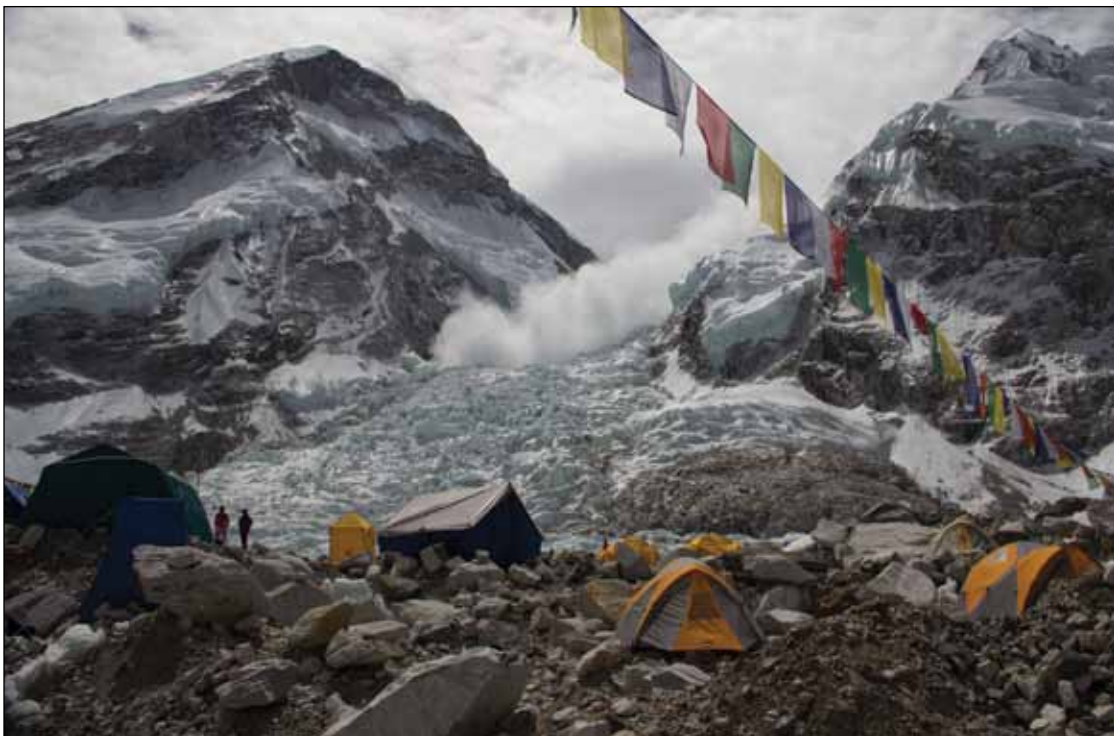
Avalanche cloud over Base Camp.

From our camp, Dave didn't quite get a good view of the action and so I informed him on the severity of the situation. We scanned the radios, getting updates on the status of each expedition; things were scattered, but it seemed most people were accounted for. We had little concern about our team as we knew all members to be up at Camp 2 or higher. The main effort soon revolved around the man who had fallen into a crevasse; he had been rescued from the void but was in critical condition. People on the scene were rushing to set up a tent to treat him and mark out an area for a potential helicopter rescue. The medical reports