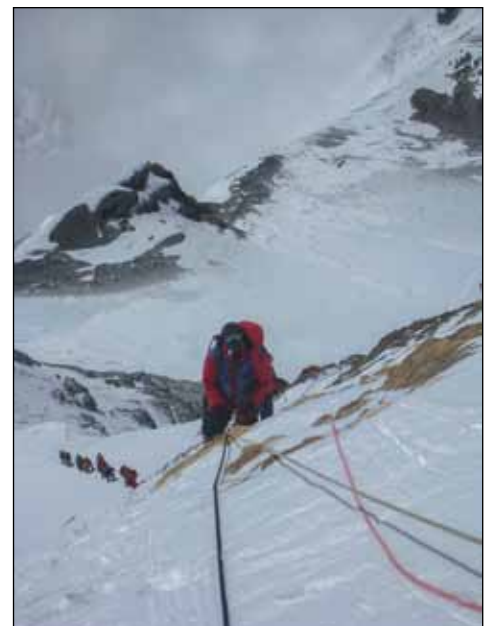
The rope-fixing team moves through the Yellow Band.

I figure it happened to the Koreans because they got to the South Col, donned their gas masks, and then realized the mask caused their glacier glasses to fog; so they went without glasses. At that elevation without glacier glasses — forget about it — your eyes will get scalded. After the blindness set in their Sherpas were known to be helping them down. But, to compound the problem, one of the Koreans came down with High Alti-