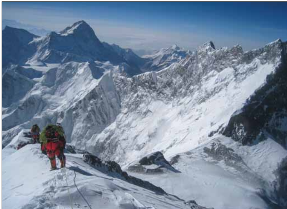
Rope-fixing team members just above The Balcony.

It's mid morning here and I'm listening to the radio as I write this, and right now it seems there is a fifth person, just below the Balcony, who is stumbling around, and apparently has resisted somebody's attempt to help him. The