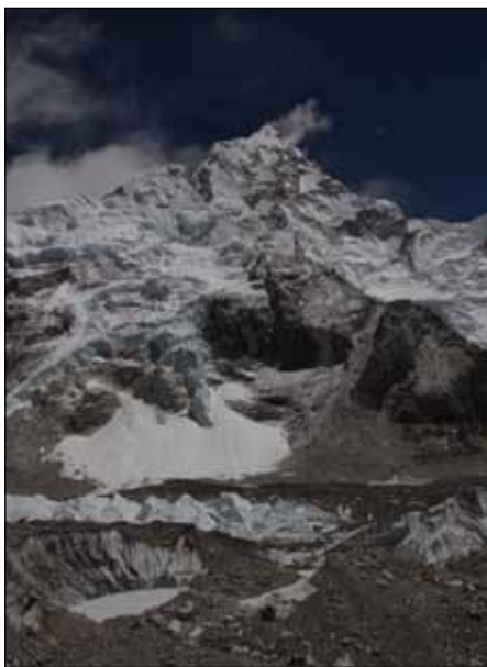
West Face of Nuptse.

Camp 2 is located on the north flank of the Khumbu Glacier, where the glacier is covered with rocky debris from Mount Everest which towers above. My overriding impression of Camp 2 is the wind – the never-ending roar of the wind, thousands of feet overhead as the jet stream winds a circuitous path around