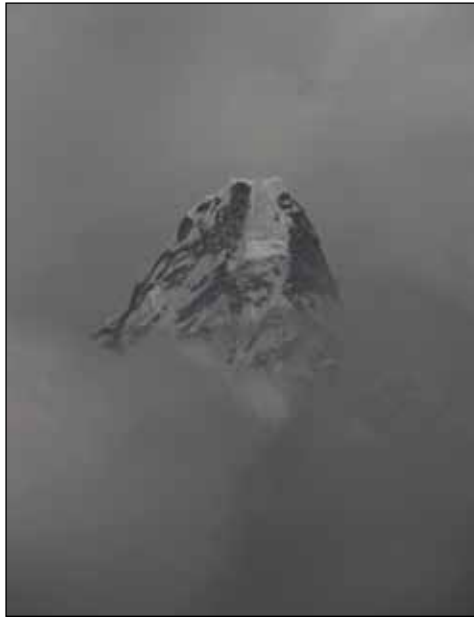
Ama Dablam.

The Greater Himalaya are rising so rapidly that many of the smaller tributaries to the main rivers have not had enough time to cut sizeable canyons. The valley slopes are incised by narrow slot canyons that