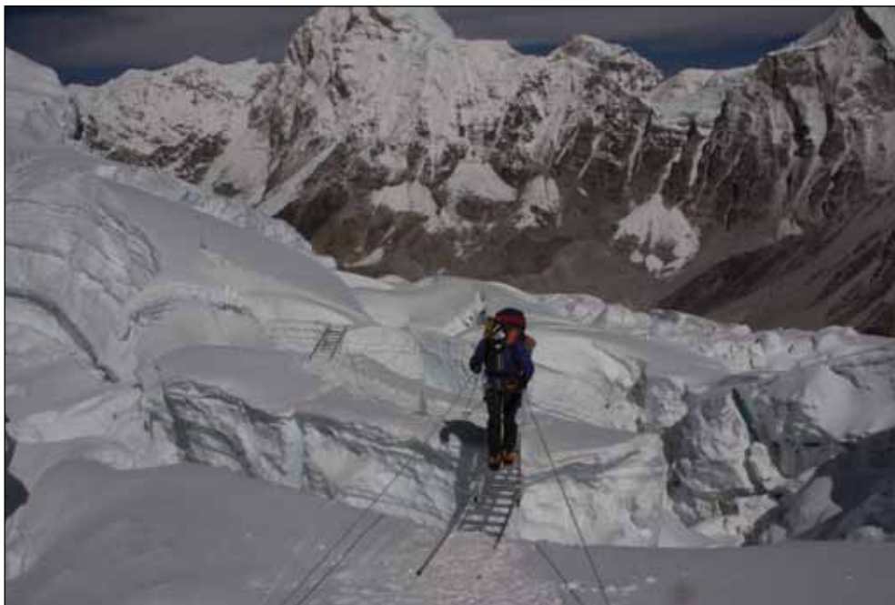
Ladder crossing on the way to Camp 1.