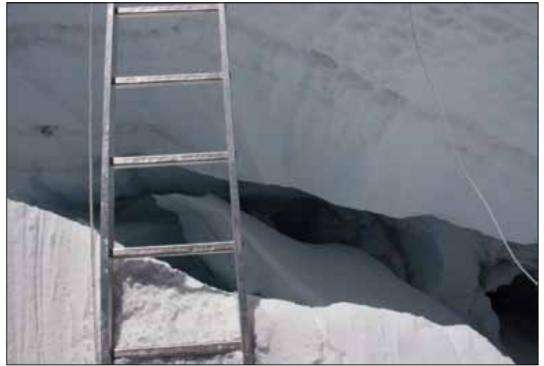
The view into a crevasse.

Camp 1 (19,300 ft or 5882 m) lies atop the icefall amongst large transverse crevasses created by the Khumbu Glacier bending over the crest of the bedrock precipice that creates the icefall. From camp you can see the summit of Everest, Nuptse and Lhotse, the land is so big you have absolutely no grasp of scale. The summit of Everest appears to be