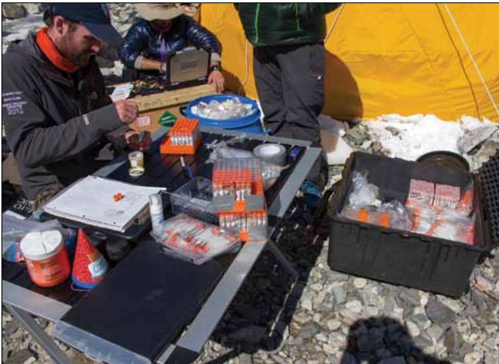
Mayo researchers pack up blood and urine samples before heading home.

One of the pieces of data they're collecting, that I think is pretty cool, involves calorie consumption. The doctors had the team drink a solution of stable isotopes which allow the docs to pinpoint the exact amount of calories burned between urinating. So on the summit day each climber will take a urine sample at the outset and then another on their return. By doing this, for the first time ever Mayo doctors will be able to calculate exactly how much energy a climber uses to summit Everest. They will also have climbers do the same for camp-to-camp travel, resulting in a caloric value for going from Base Camp to the summit of Everest. This is just one of many "firsts" that Mayo will be making while doing their research up here.