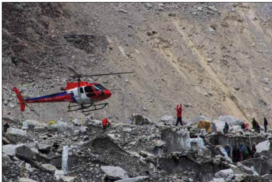
Helipad at Base Camp.

Today Cory is stable in Kathmandu hospital, receiving the necessary tests to see exactly what was affecting him. Right now things are hanging in the balance for Conrad and Cory's West Ridge attempt, but either way it looks like Cory will be OK.