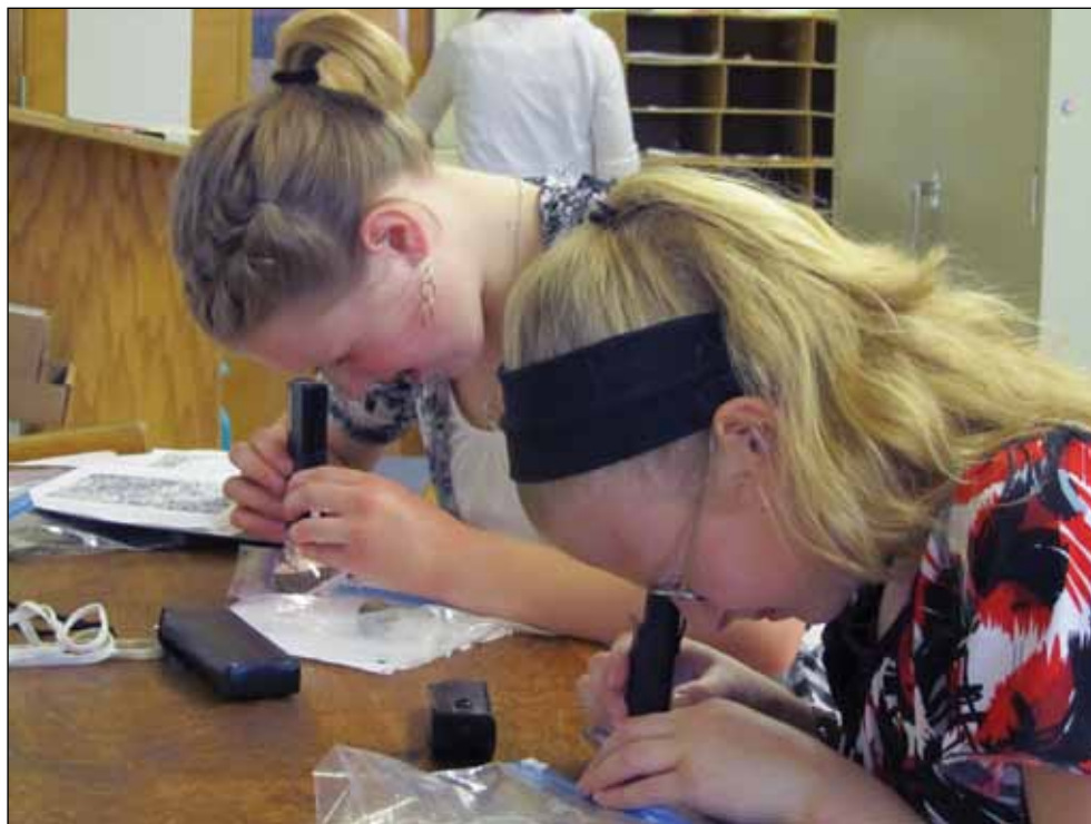
Students in Winifred, Montana examine rock samples.