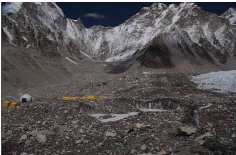
Everest Base Camp.