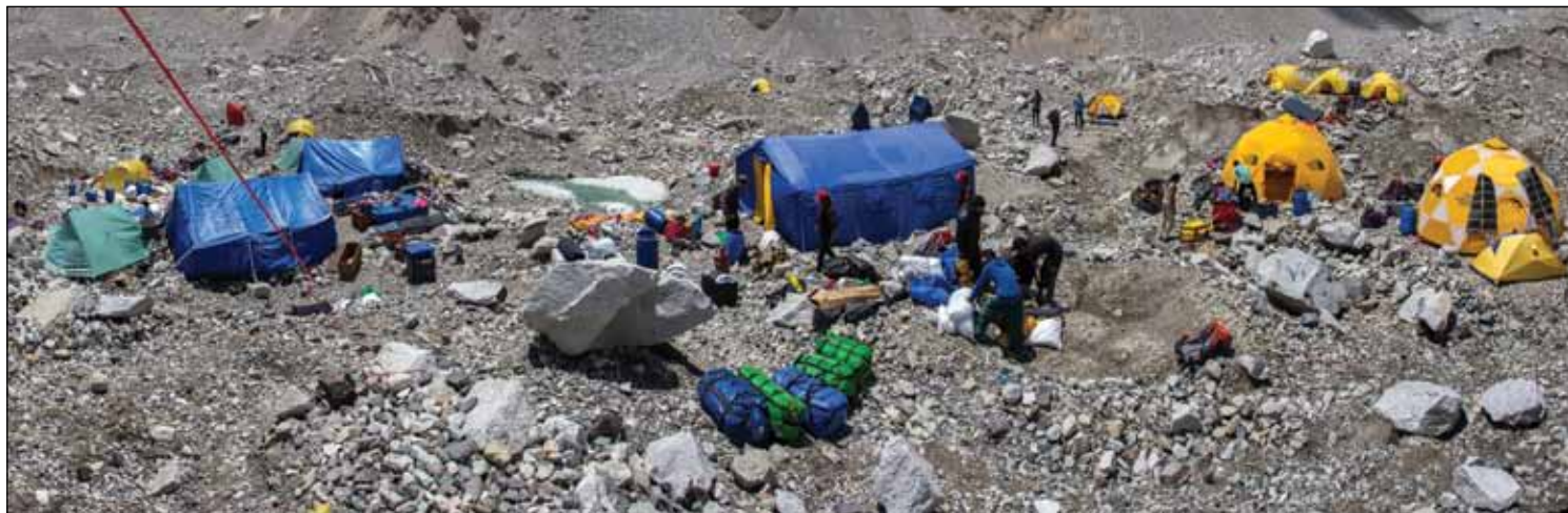
Base Camp.

So, every day Base Camp gets a little bit emptier, and it seems our expedition will be one of the last to leave. This is slightly ironic as we were the first to arrive here and were ahead of everyone in terms of acclimating. In fact we were ready to summit in early May and were certainly planning on it. Instead, the mountain had other plans and we had to be patient, but now, our time is near!