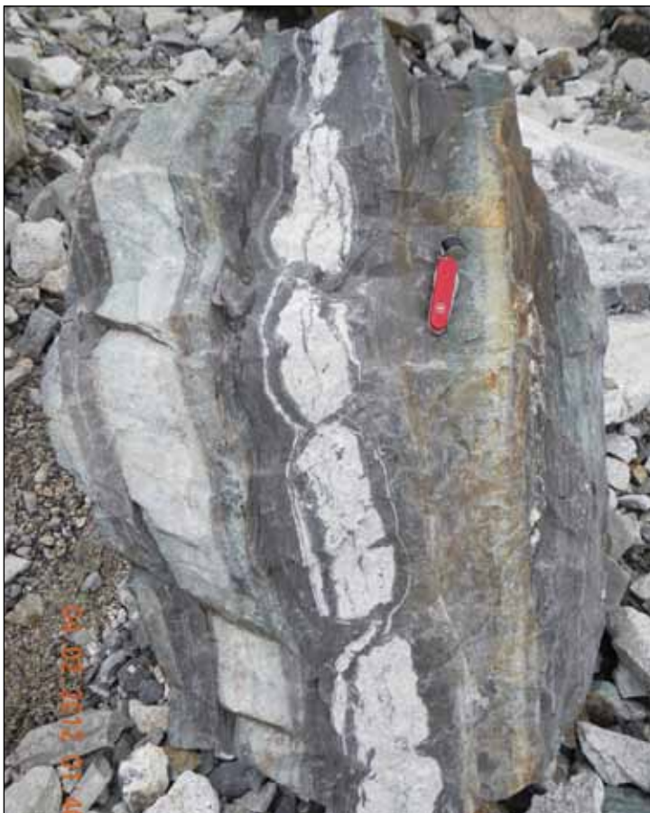
This boulder displays a boudinaged vein of quartz and feldspar. Photo by Dave Lageson.

Tomorrow, about half the team leaves for our first “rotation” through the Khumbu Icefall. They will leave in the pre-dawn hours and climb through the icefall to Camp 1, where they will spend the rest of the day and the night. The next day, they will hike up the Western Cwm to Camp 2 where they will spend two nights before returning to EBC. The rest of the team (me included) will follow the same schedule, starting day-after-tomorrow. This first rotation into the Western Cwm is needed to acclimate to the ever-increasing elevations on Everest. It is