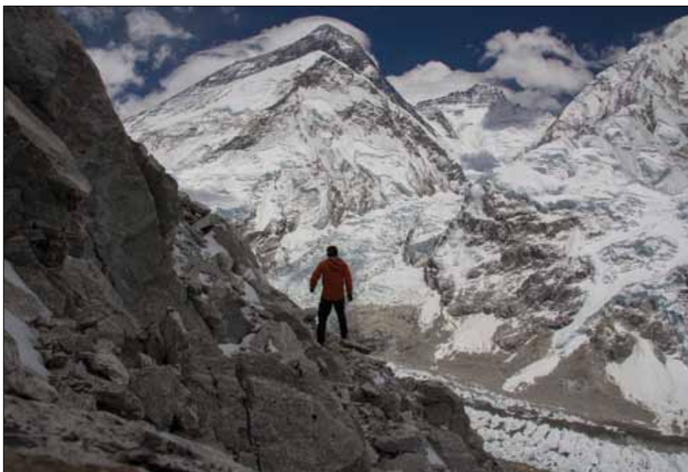
Travis on Pumori looking out over the lower Khumbu Glacier.

When the SE Ridge climbers return in a few days, they will hopefully have more rock samples taken from the outcrops on the Lhotse Face. The day before the climbers left on the 9th, I refined the rock sampling method in order to make it easier for them, and I'm curious to see how well it worked. Here is the outline of how the rock sampling will be done - When the climbers or Sherpas bang a rock sample off of an outcrop, it's critical for them to record where the sample was taken. Recording that info is tough when you're bundled up like an astronaut; writing in a journal or using a GPS unit becomes cumbersome and time consuming. So the method the climbers will use involves putting the sample into a Ziplock bag, then recording the elevation