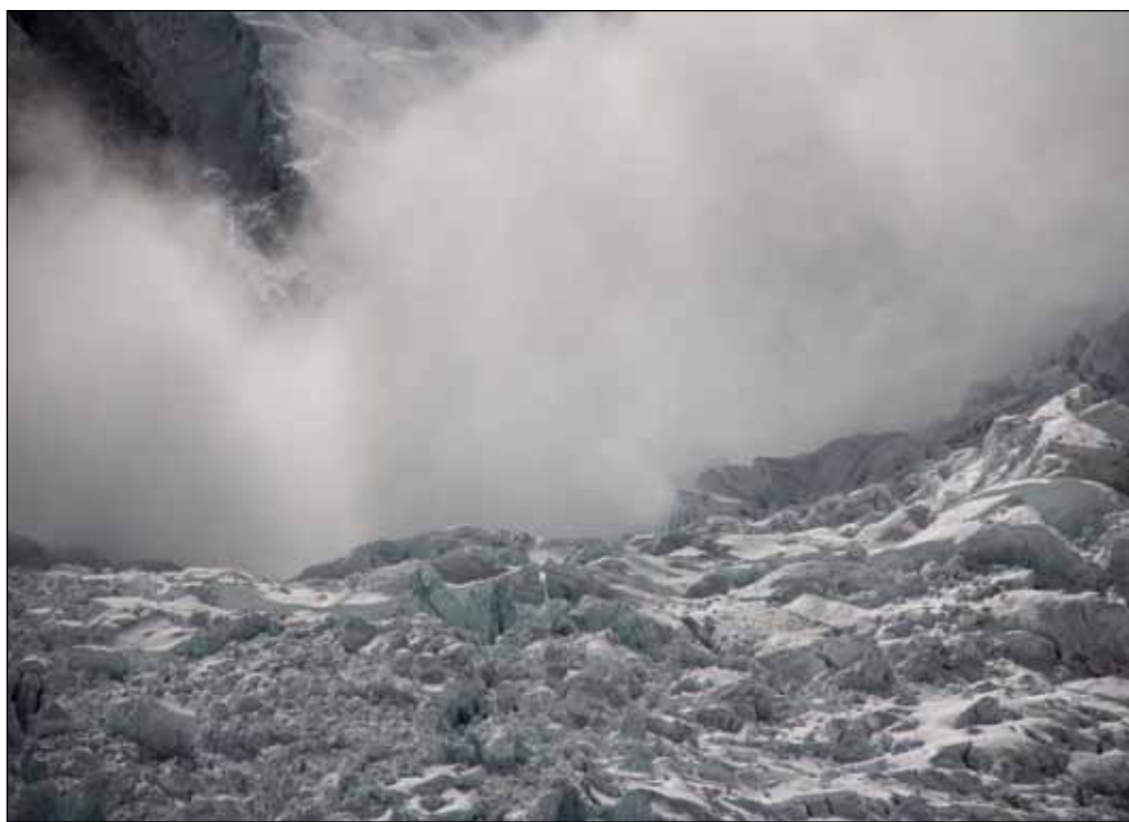
Avalanche cloud.

After breakfast I took a walk up to the Everest ER medical clinic where I found myself sitting in the sun, chatting with some of the staff. The ER location is as far up valley as a base camp location can be, which offers a great look at the icefall and into the beginning of the Western Cwm. While chatting with ER staff and enjoying the morning rays, we heard the common rumble of an avalanche and looked up to the faces that flank the icefall, but saw no avalanche. We looked back at each other to continue talking but the rumble increased and we looked back, but again saw nothing. Seconds later people began screaming and shouting and this time we looked up to see a cloud of snow over 100 ft (30 m) high barreling out of the Western Cwm over the top of the icefall. The mass of snow was so tall it didn't even seem real and it filled the entire width between the walls of Everest and Nuptse. We were in disbelief - Camp 1 sits right at the top of the icefall. All you could hear was people saying "no, no, no" as the cloud pushed out over the icefall. Near the top of the fall I could see a single file line of small black dots disappear, people, making a routine descent were now enveloped by the expanding cloud. All we could