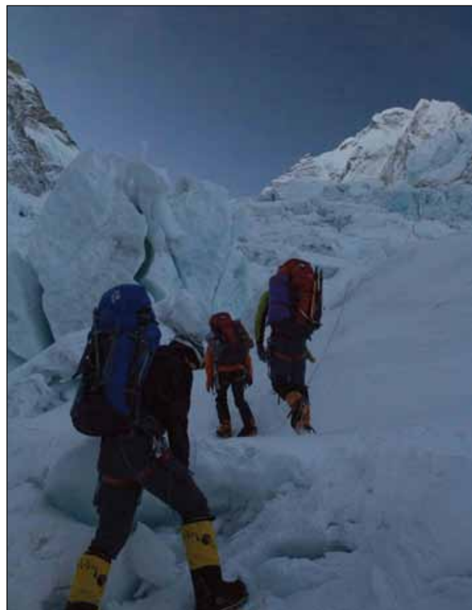
Heading through the Khumbu Icefall.

The route through the icefall is set by the "icefall doctors," a group of six Sherpas who establish and maintain the route each season. One of the fees paid by all expeditions using the icefall, goes