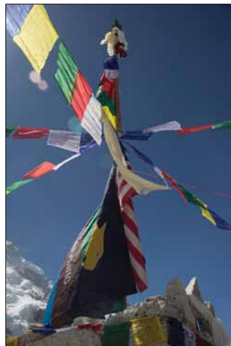
Puja Ceremony.