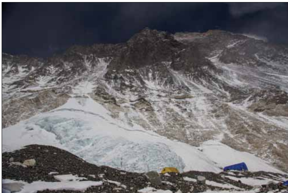
Camp 2 at base of Everest southwest face.

The hike to Camp 2 isn't terribly hard as the gradient never gets too steep; however, you do gain 2,000 ft (609 m), bringing you to 21,500 ft (6553 m). It took about three hours of hiking with the first hour bringing us to several ladder crevasse crossings. You can see Camp 2 for most of the trek and it seems so close, but the epic scale of things is deceiving you, and Camp 2 continues to loom in the distance like an oasis. Sam, Kris and Hilaree left before Andy and me, so we were basically the only two people we could see as we hiked through the vast Cwm. After the ladder crossings early in the hike, I pulled ahead of Andy and we soon were black dots to each other. The air got noticeably thinner as I went and two breaths per step was my pace. It was a clear, blue, windy day and the summit of Everest was enveloped in lenticular clouds that churned like water boiling in slow motion.