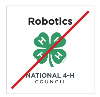
Don't add additional elements to the logo.