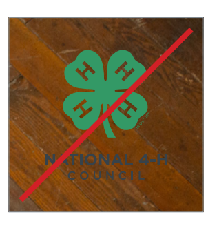
Don't place the color logo on dark or busy images.