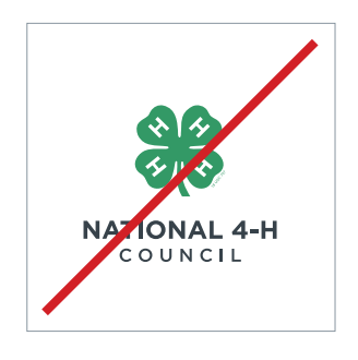
Don't change or separate the elements of the logo.