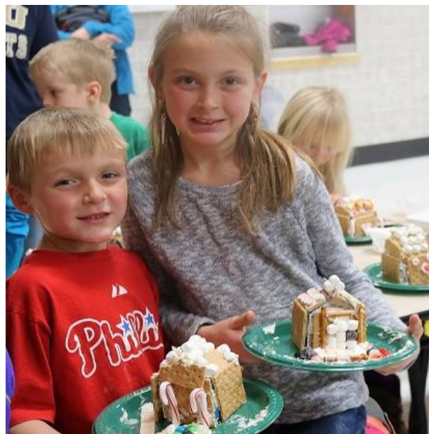
Building gingerbread houses after learning about food safety and hand washing techniques brings a smile to these young faces!

During the course of the afterschool program, 55 students were reached. Of those 55, 24 were already 4-H members. Seven have enrolled in 4-H as a new member as of October 2016. There are 15 more that aren't old enough to be a full 4-H member yet, but are waiting patiently to join!