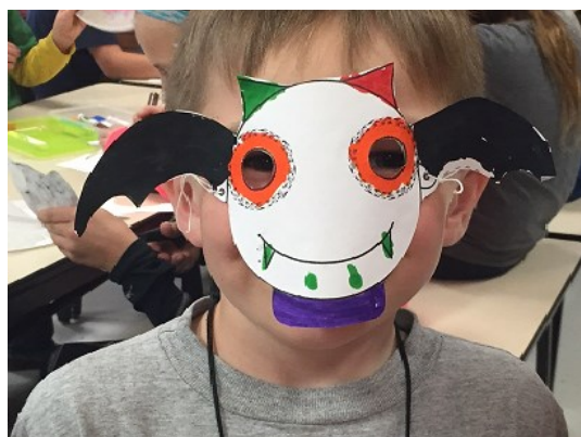
A participant in the October program shows off his bat mask.

In addition to Stanford, students came from Denton, Geyser, and Hobson to participate in the learning activities.