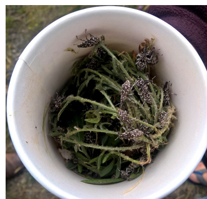
Above: Exit hole from Larinus Spp. in a seed head. Right: Cyphocleonus achates waiting to be dispersed.