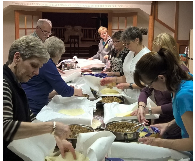
Attendees busily prepare and wrap their dishes at the Freezer Meal Workshop during National Frozen Food Month.

A common problem for busy families is having time to prepare nutritious meals. Through freezer meal and slow cooker workshops, this problem can be alleviated. Partnering with MSU Extension in Fergus County, safe food handling techniques and proper freezing protocols were taught to interested participants. Learning how to make shopping lists for several recipes, and dedicating a day to making several dishes to wrap up and freeze is very helpful to families on the go in the working seasons. Advance preparation allows for saving time and money, while still eating healthy. Through this class, attendees were given the opportunity to make and keep two dishes each. They also received the recipe and instructions for many more.