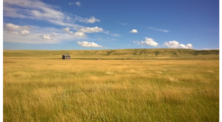
A pasture in Judith Basin County that has been renovated recently. Weed control techniques and grazing management techniques promoted by MSU Extension have been applied.