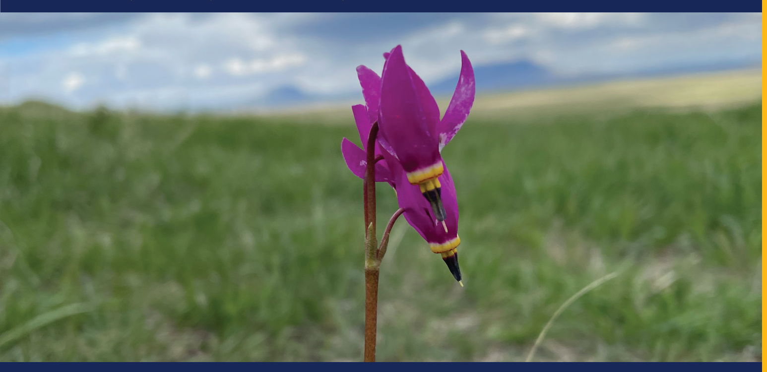
Shooting Star with Square Butte in the background by Jerry Marquardt.

PO Box 427 | 406-566-2277 | judithbasin@montana.edu | judithbasin.msuextension.org