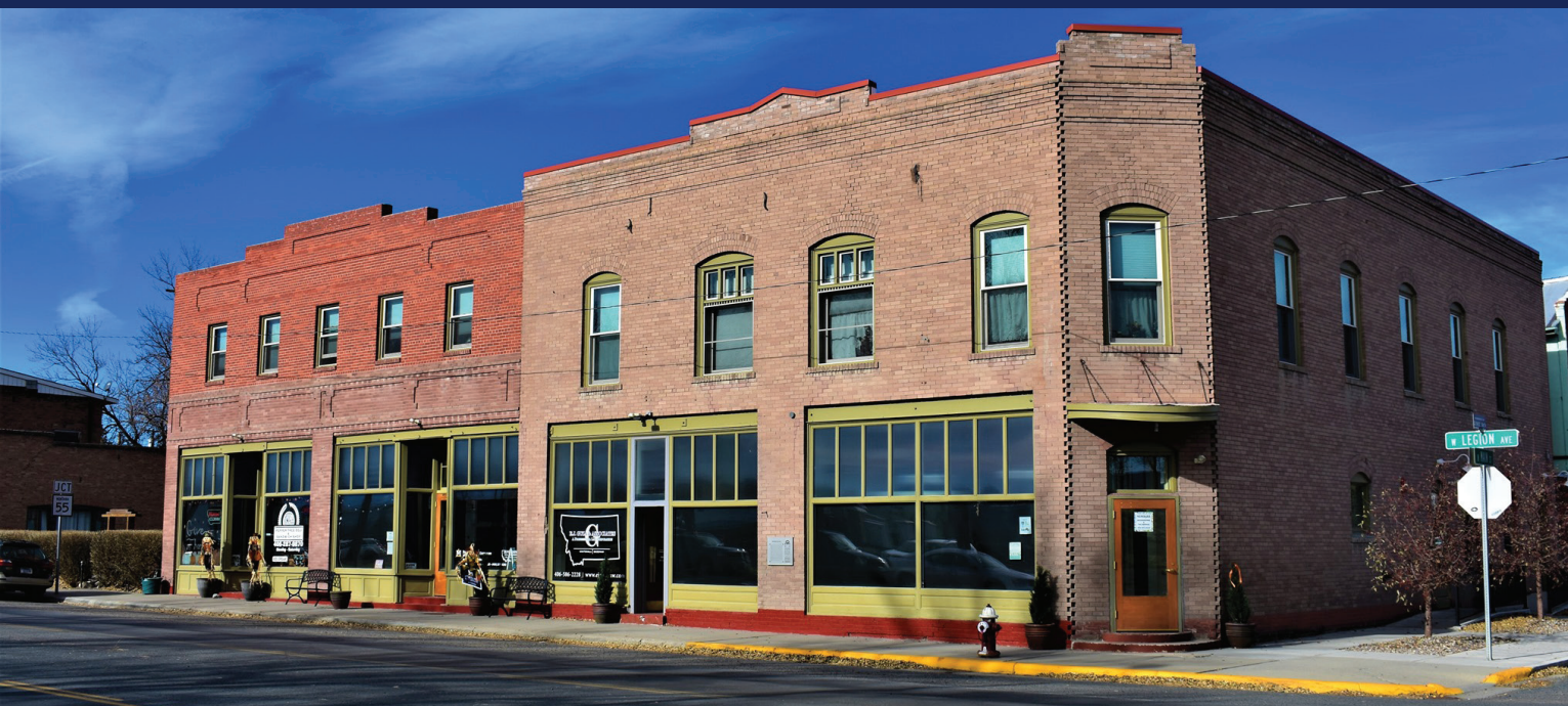
Whitehall MSU Extension Office

103 West Legion Ave. PO Box 1079, Whitehall, MT 59759 | 406-287-3282 | madisonjefferson2@montana.edu | http://madisonjefferson.msuextension.org/