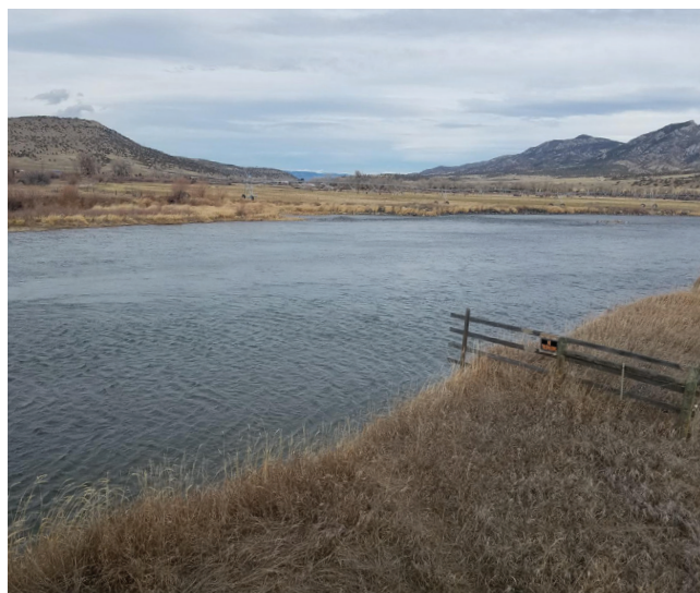
Top Row: (left) Vermi-composting demonstration with youth, (right) Golden Sunlight Mine, Center: Participants are pictured in a field, doing a rangeland health monitoring activity, Bottom Row: (left) Youth creating habitats with various art supplies, (right) Jefferson River