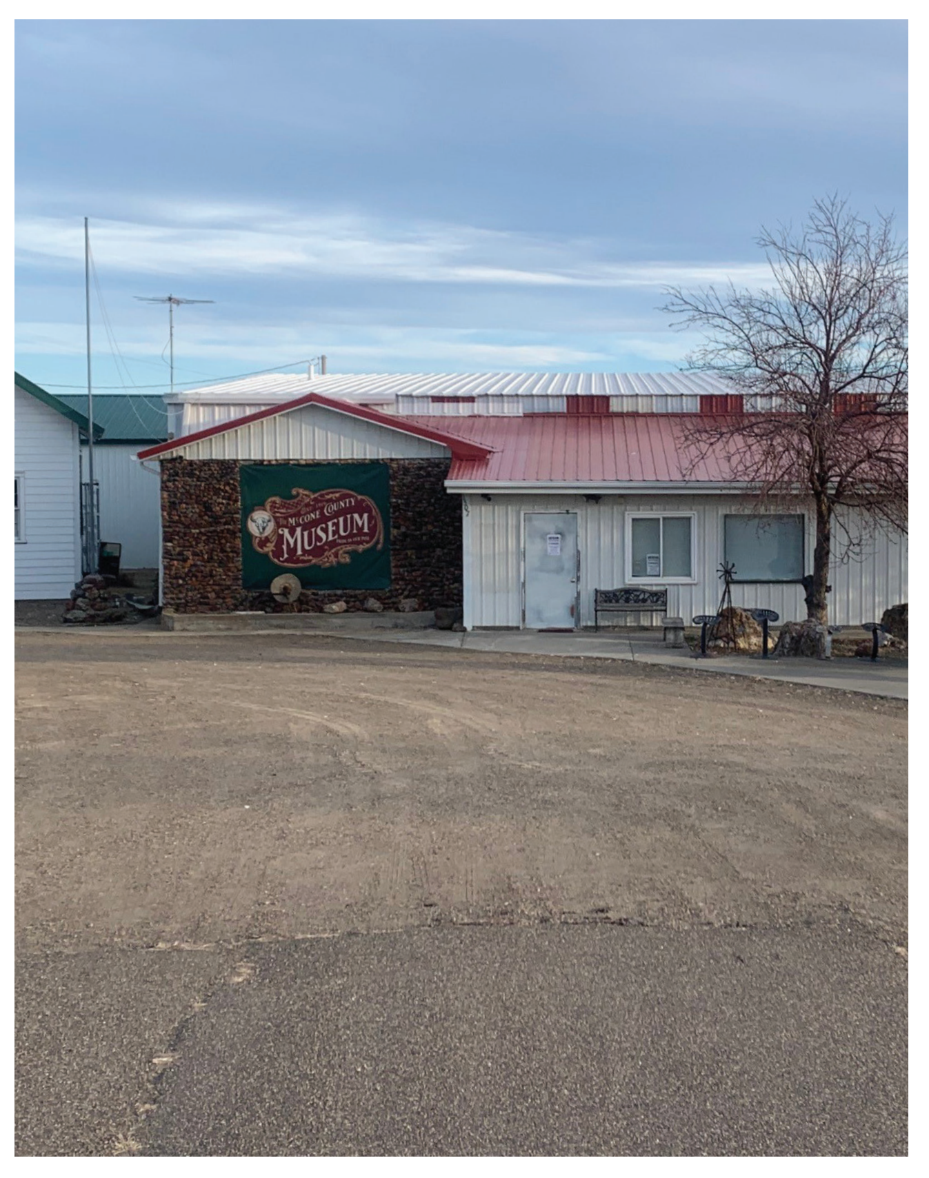
Previous Page: (top) Hog and Sheep barn, by Tandi Kassner; (bottom) Forage Samples, by Tandi Kassner; This Page: McCone County Museum, by Tandi Kassner