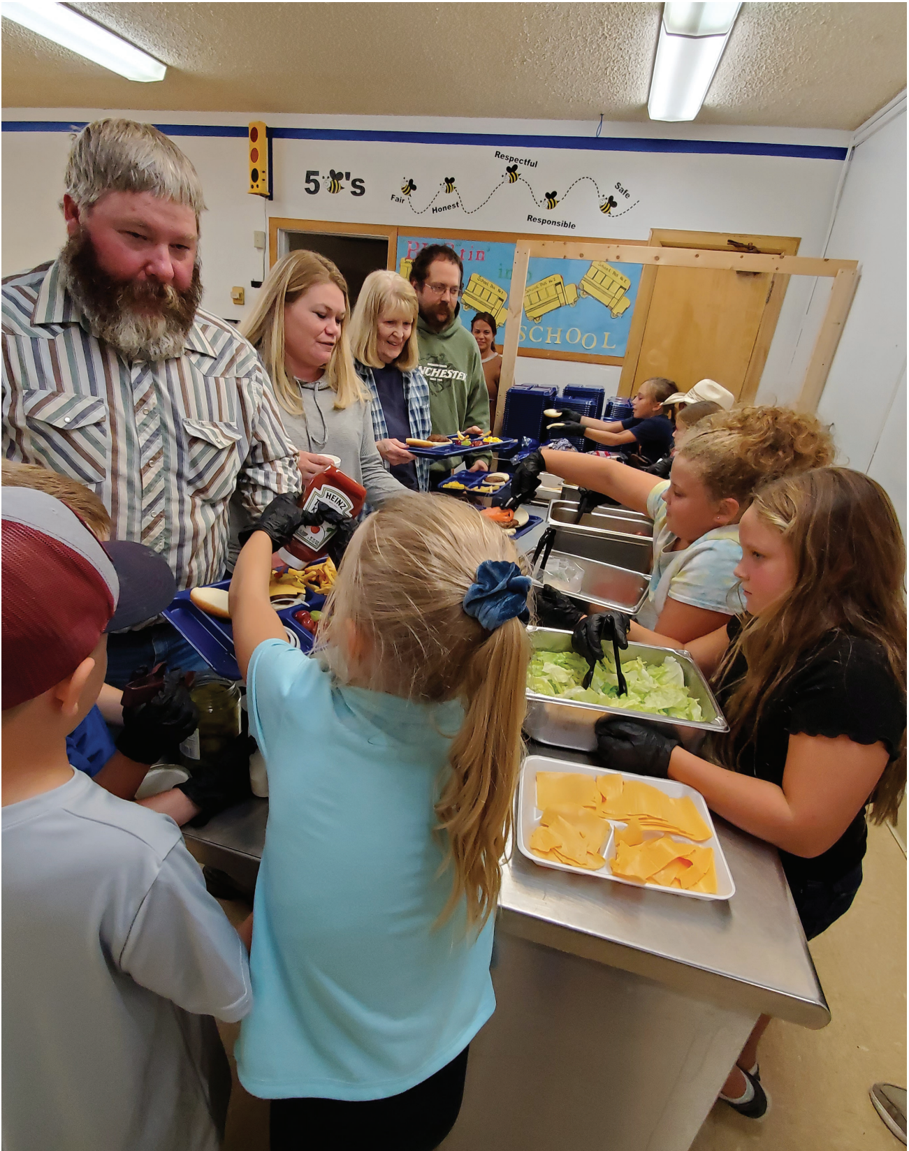
Previous Page: (top) Livestock reservoirs across Phillips County are drying up in 2021, (bottom) November 18 drought monitor map, This Page: Phillips County Cloverbuds dinner 2021