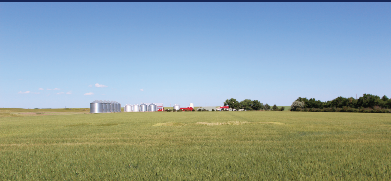
Crop test plots in Phillips County, photo courtesy of Marko Manoukian.

P hillips County is in North Central Montana along the Hi-Line. It encompasses 3.2 million acres with 33% being managed by the Bureau of Land Management and 48.5% as private lands. Other land managers in the area are Montana State Lands, U.S. Fish and Wildlife Service and the Fort Belknap Indian Reservation. Agriculture is the main industry in Phillips County, consisting of 53,000 mother cows (ranking third most in the state); 5,900 sheep; 363,200 of crop acres; and 40,000 acres of irrigated land. The gross value of all agricultural commodities in 2017 was about $77.9 million dollars excluding any government program. Recreation is also an industry in the county with big game and upland bird hunting. Warm water fish species are available in the Milk and Missouri River, which make up the southern border of the county. The Nelson Reservoir is a large irrigation reservoir that also has warm water sport fishing.