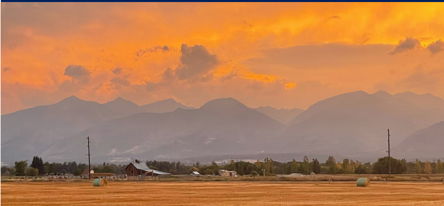
Hay field in Corvallis, MT

215 South 4th Street Suite G Hamilton, MT 59840 | 4063756611 | ravalli@montana.edu | https://ravalli.msuextension.org/