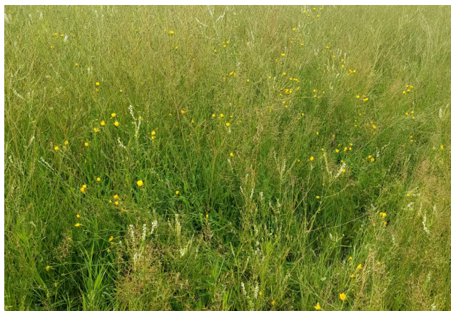
Turkish Hawksbeard

Ravalli County utilizes the Schutter Diagnostic Laboratory frequently throughout the growing season. On any given week from March through September, the office is receiving on average 40 questions and samples for identification or mitigation. When samples are received in the office, the agricultural agent and administrative assistant become researchers, investigators, and educators in identification, prevention, control, and mitigation. Many samples submitted to the office are identified or resolved in-house, relying on the knowledge and expertise of the office, networking, and neighboring resources. Pieces that need confirmation or expert evaluation are submitted to The Schutter Diagnostic Laboratory in Bozeman.