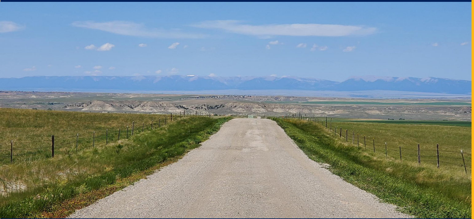
A view of the Little Snowy Mountains North of Ryegate, Montana.

204 8th Ave. East | 406-323-2704 | musselshellgolden@montana.edu | www.montana.edu/extension/musselshell-goldenvalley/