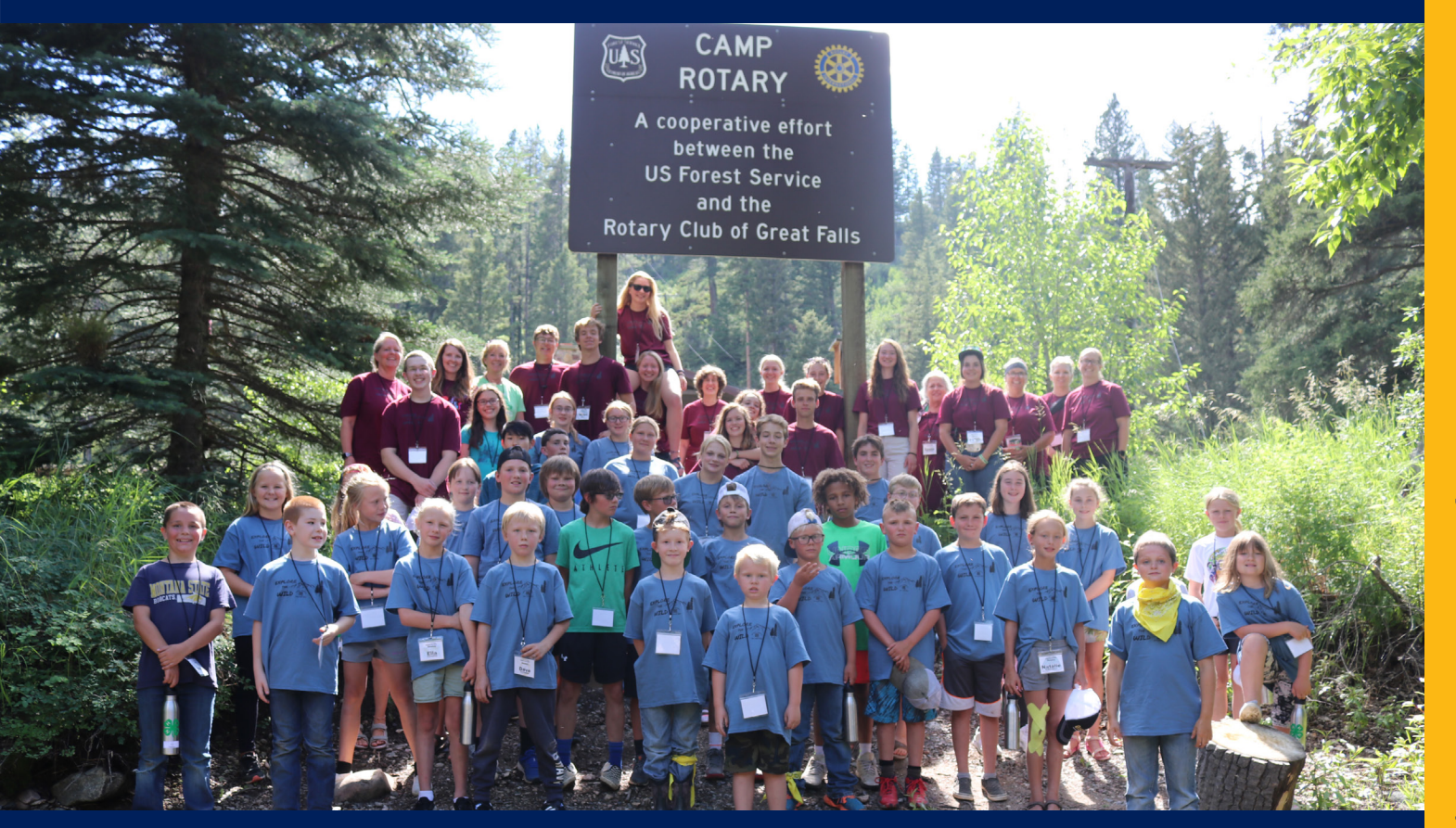
Teton County 4-H at Camp Rotary near Great Falls in July 2022, by Jenn Swanson.

1 Main Ave South / P.O. Box 130, Choteau, MT 59422 | 406-466-2491 | teton@montana.edu | www.montana.edu/extension/teton/