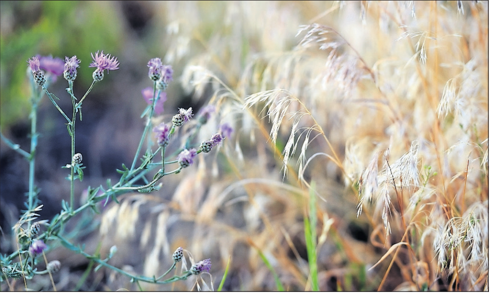
KNAPWEED side-by-side with cheatgrass, two noxious weeds that have taken over a pasture that was overgrazed.

"They eat so much when they first get out there; they're nonstop mowing machines," she said. "Grazing a couple of hours a day isn't actually resting the pasture. It's