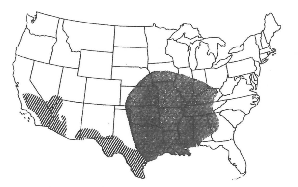
Figure 2 Endemic distributions of the brown recluse (stippling) and related recluse species (lines) in the United States, based on Gertsch and Ennik.<sup>2</sup> Recluse populations become sporadic on either side of the demarcating range borders.

Despite the lack of brown recluse spiders in California, several hundred cases of "brown recluse bites" have been reported to me in the past decade. Undoubtedly, this is only a small fraction of the total number of brown recluse bites that have been diagnosed. Although it might appear intuitive from figure 2 that these bites could be caused by the native desert recluse (Loxosceles deserta), which lives in the comparatively sparsely inhabited southeastern quadrant of California, virtually all so-called brown recluse bites have come from coastal regions with a concentrated human population. In particular, many originate from the San Francisco Bay-Sacramento area, which lies north of the native desert recluse distribution (figure 2) and has never supported a population of any recluse species. Similar scenarios have emerged from other states, cities, or regions-Vermont, New York, Pennsylvania, Florida, Chicago, South Dakota, Colorado, northern Nevadawhere recluse spiders are extremely rare (<10 ever collected) or have never been documented.2 There are published California accounts of 2 "brown recluse bite" case histories from a city where recluses have never been collected3 and a physician misidentification of a common spider as a brown recluse, captured while biting a child.4 Brown recluse bites are overdiagnosed in coastal and Northern California.