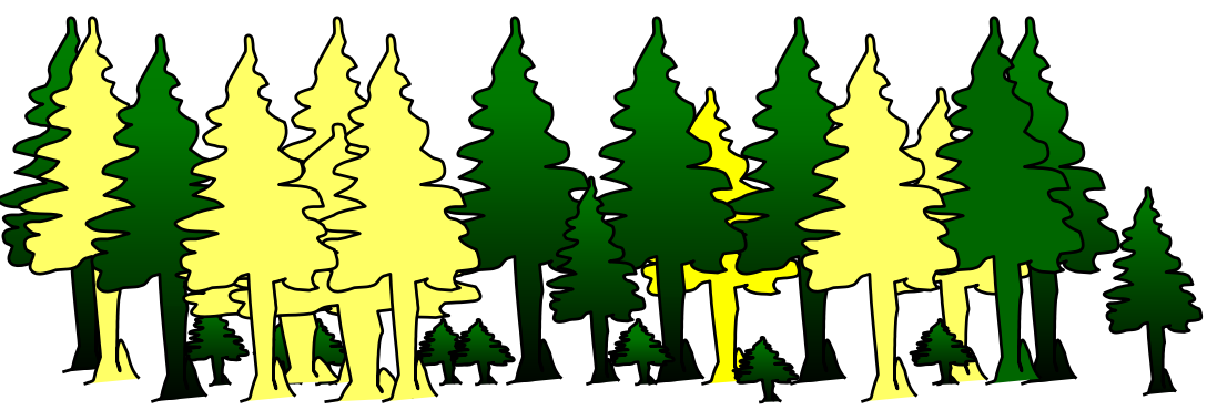
Single tree selection and group selection (light color are cut trees)

for patches of trees to be treated differently although large scale evenaged treatments also work. Often the stand of trees itself will indicate what naturally would have occurred. For example, an area that has dense standing trees with large amounts of down woody debris would have led to a crown fire, burning all trees in that area and creating a large clearing. Stands that have a random spacing of dense and open grown trees would have burned in clumps creating small opening while leaving the more open spaced trees intact. Areas that are composed of large well spaced trees would have supported a fire that stayed on the ground with an occassional tree burning up. Mosaics such as these provide multistructural forests and are often the most productive wildlife habitats. Harvesting patterns can vary from several acre openings to individual tree selection. It is important to recognize that many different treatments can be used within the same stand of trees.