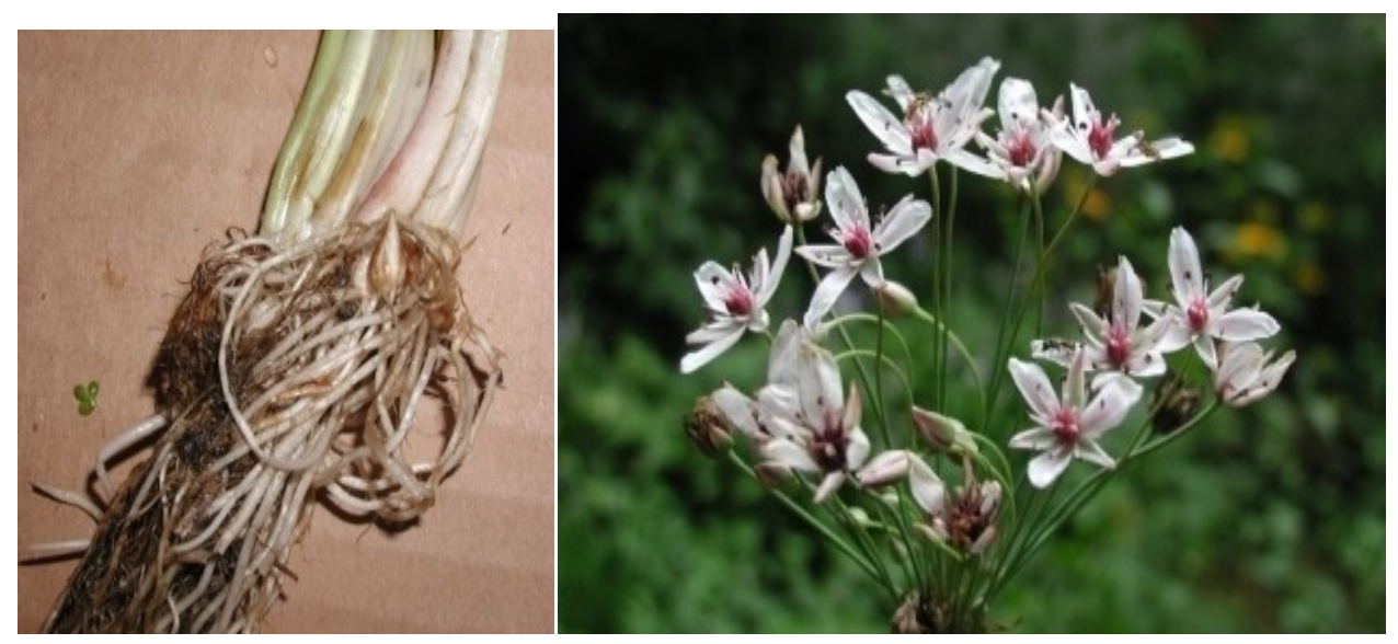
Management Options: Mechanical, cultural, or chemical.

Damage Potential/Toxic: Plants interfere with boat propellers, swimming, and fishing.