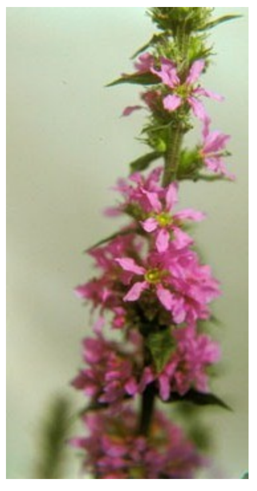
Management Options: Hand-pulling, herbicide, and reseeding as follow-up.