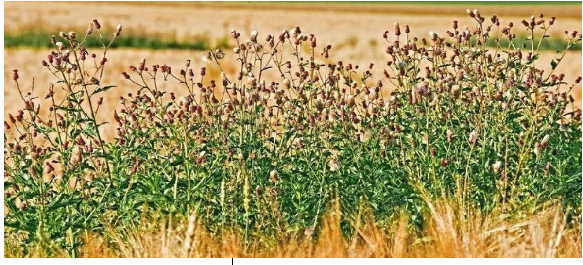
Management Options: Insects, grazing, cultivation, hand-pulling, herbicide, and reseeding as follow-up.