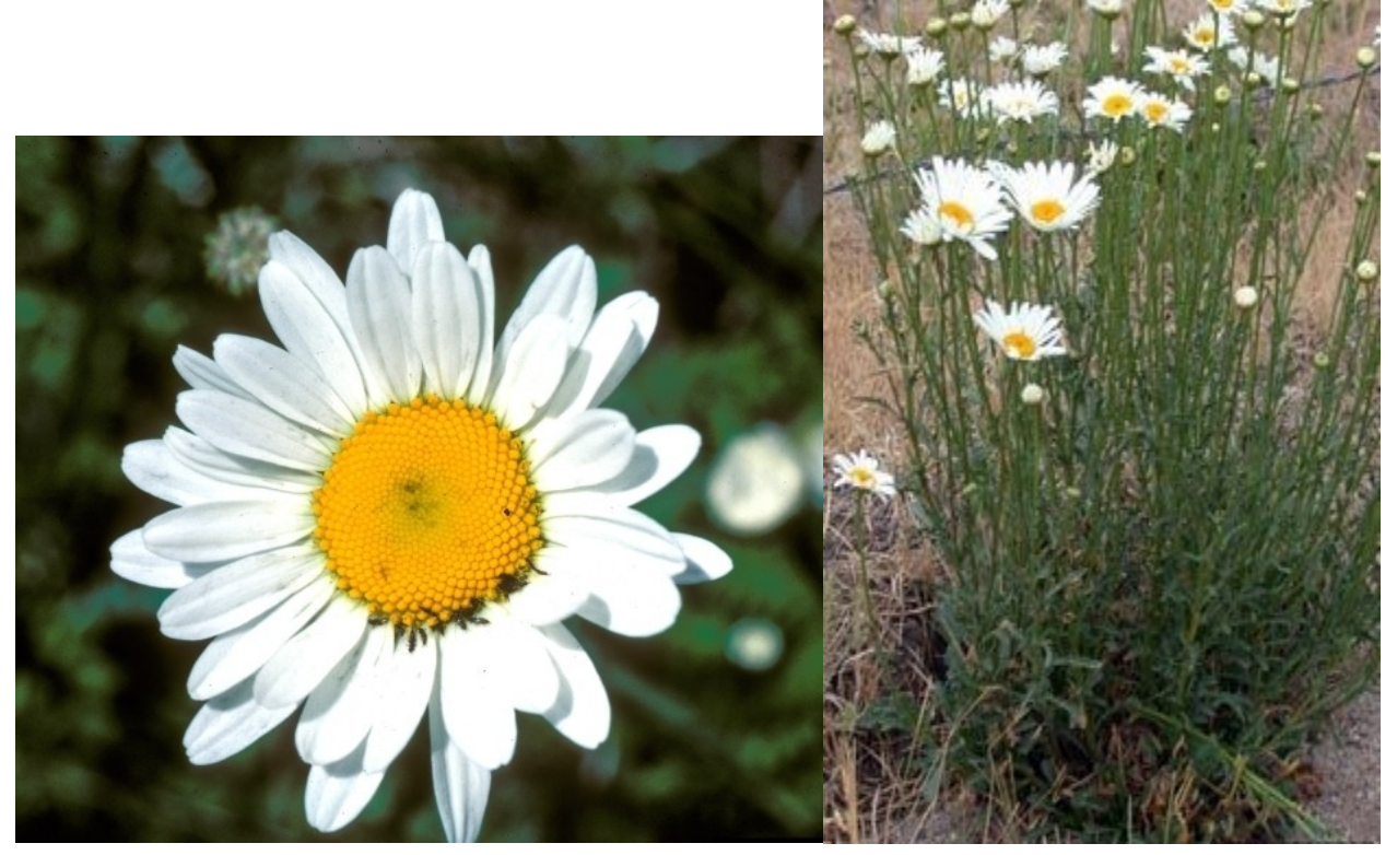
Management Options: Insect, grazing, herbicide, pulling, cultivations and reseeding as follow-up.