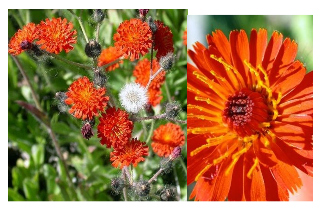
Management Options: Hand-pulling small patches, herbicide, and reseeding as follow-up.