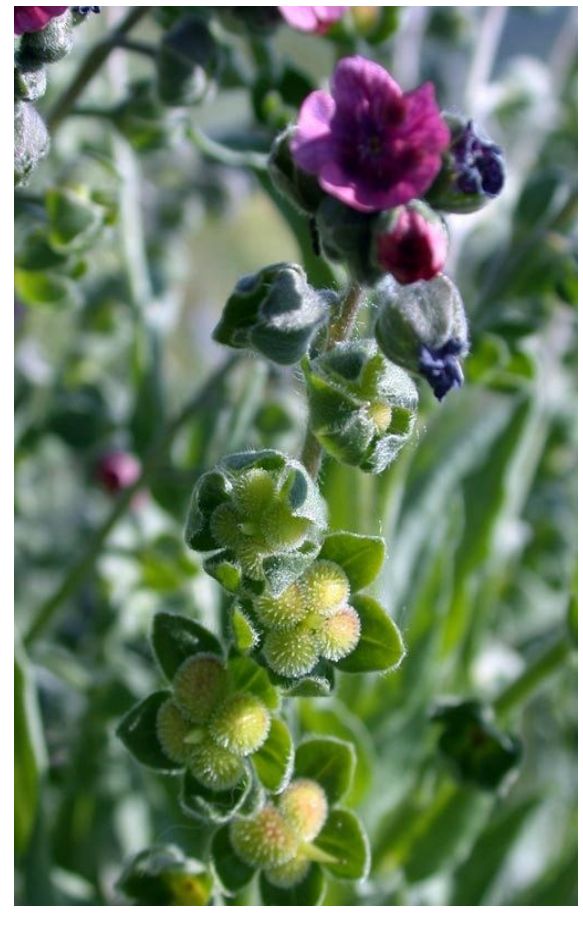
Management Options: Cultivation, hand-pulling small patches, herbicide, and reseeding as follow-up.