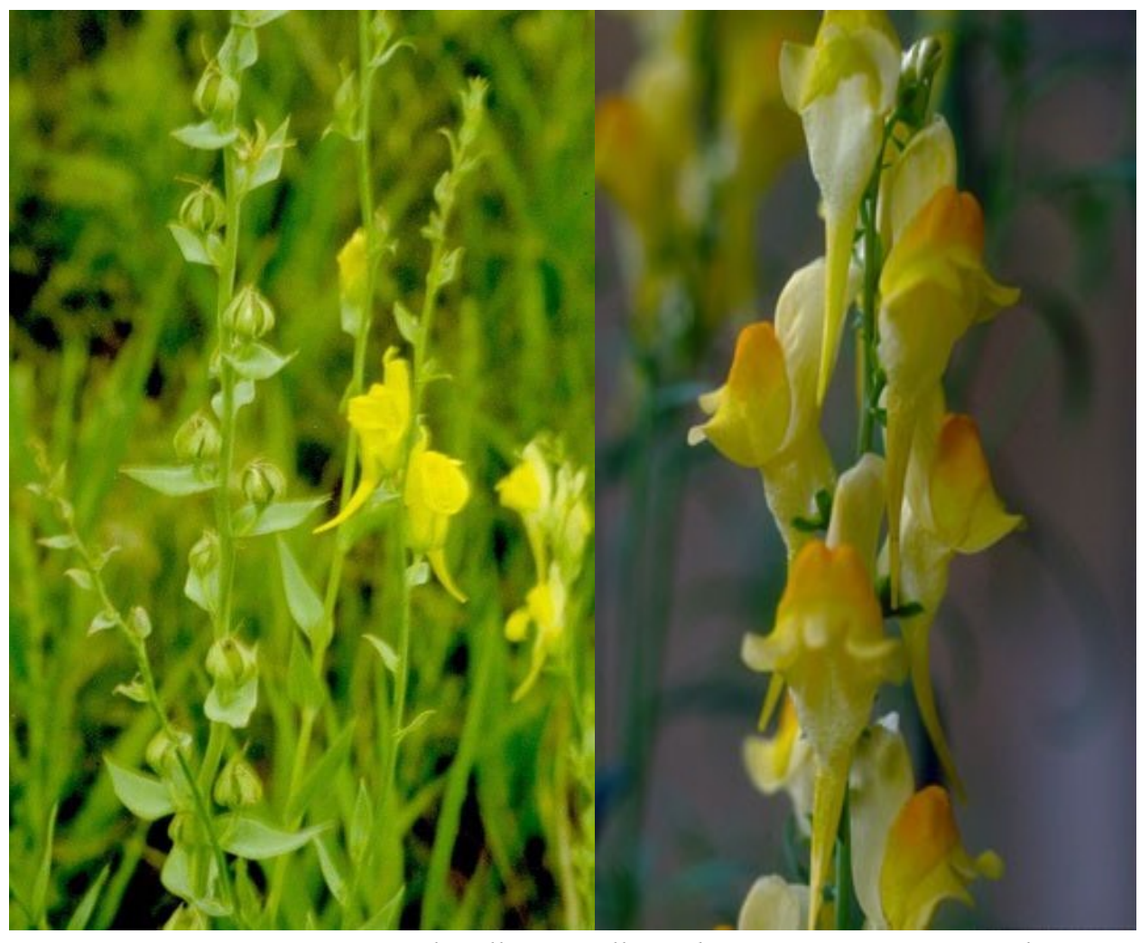
Management Options: Hand-pulling small patches, insects, grazing, and herbicide.