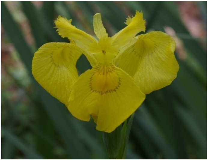
Management Options: Hand-pulling small patches, herbicide, and reseeding as follow-up.