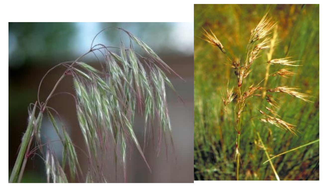
Management Options: Grazing, herbicide, hand pulling/digging, and cultivation.