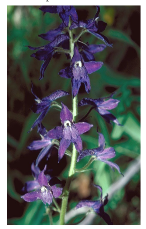
Management Options: Contract local weed control.