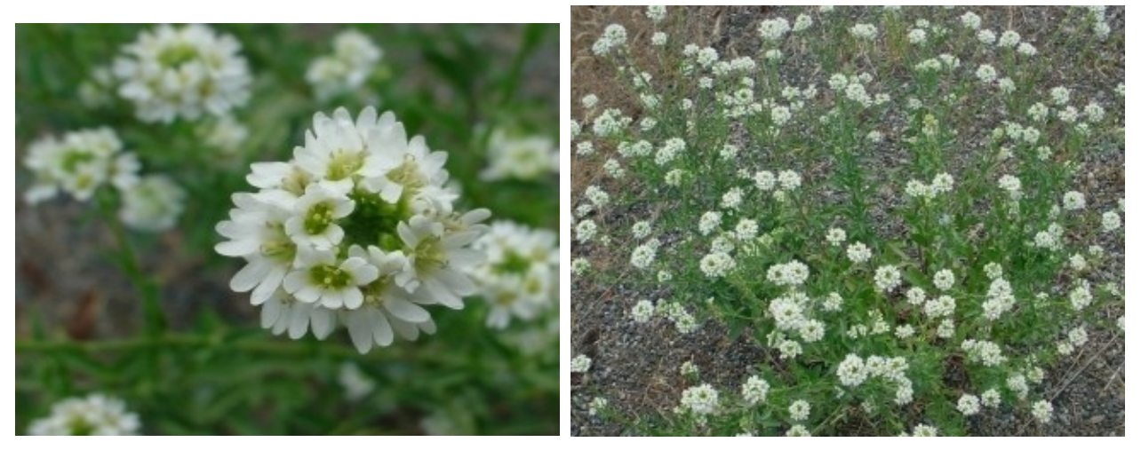
Management Options: Hand pulling, cultivation, herbicides.